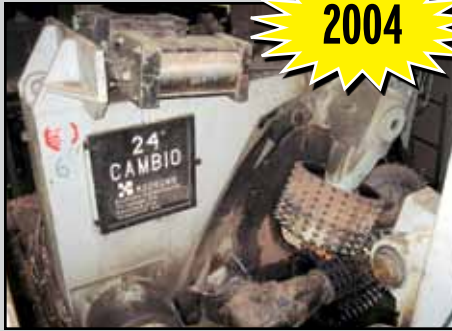
KOCKUMS CAMBIO 24" MECHANICAL RING DEBARKER