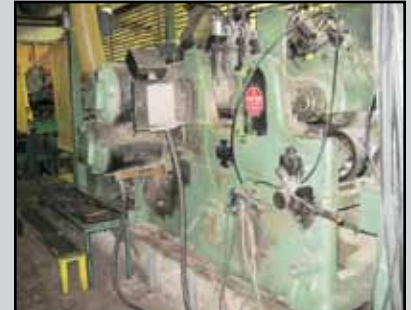
YATES AMERICAN 24 KNIFE PLANER