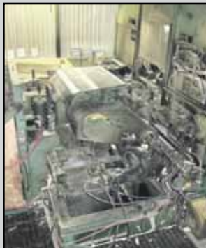
FORANO ZT1461 20" CANTER CHIPPER