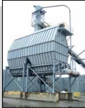
(1 OF 2) 20' X 15' TRUCK CHIP LOADER BINS