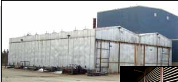
(1 OF 3) AMERICAN WOOD DRYERS, INC. DOUBLE KILNS