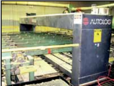
AUTOLOG CLASS IIIB LASER LOG SCANNER