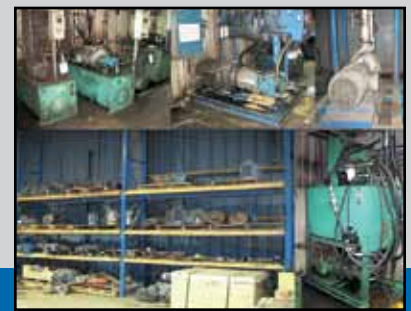
ASSORTED HYDRAULIC PUMPS, MOTORS AND DRIVES