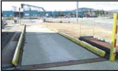
WEIGH-TRONIX 5332 70' DRIVE-ON TRUCK SCALE