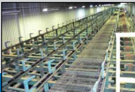
PHL TA100 80 BIN SORTER