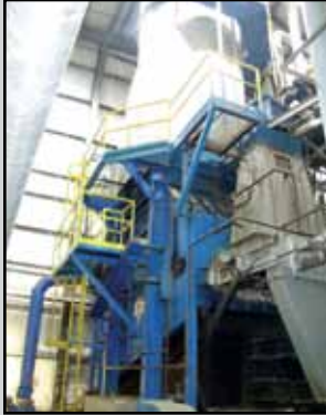
(1 OF 3) GTS 16,000,000 BTU HOT OIL FURNACES

1993 WEIGH-TRONIX 5332 70' Drive-On Truck Scale, Weightronix W1-130 DRO, 65,000 Kg capacity.