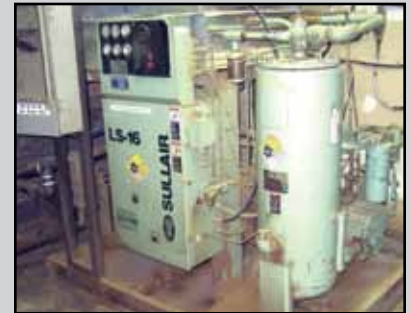
(1 OF 3) SULLAIR ROTARY SCREW AIR COMPRESSORS