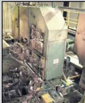
PHL SJB-72 TWIN BLADE RESAW