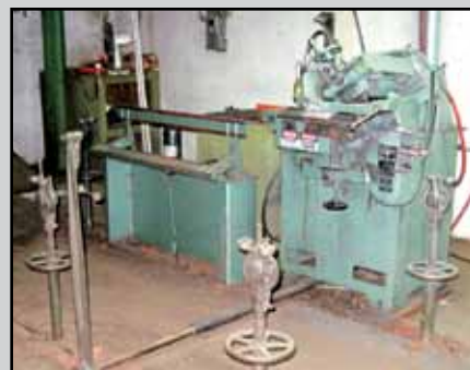
HANCHETT BANDSAW BLADE SHARPENER

LIVE ON-LINE INTERNET BIDDING IS AVAILABLE!