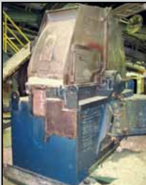
FORANO SX-439L 75" CHIPPER

1989 HUOT 88-292 45' X 12' Drum Debarker, 9'3" x 13' x 12' deep feed hopper, approximately 75' x 20" reload conveyor.