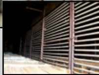
INSIDE VIEW OF KILNS