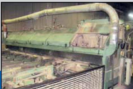
PHL MS-131 MULTI-BLADE TRIMMER