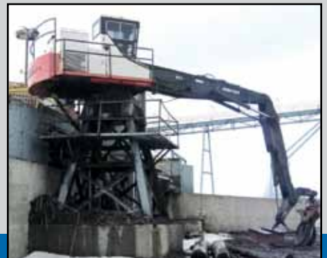
PRENTICE 625FX-FM STATIONARY HYDRAULIC LOG LOADER

1989 TANGUAY PL228EY Stationary Hydraulic Log Loader, 10' stick, 42" clamp, 3,470 hours.