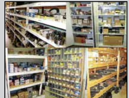
ASSORTED SPARES AND STORES