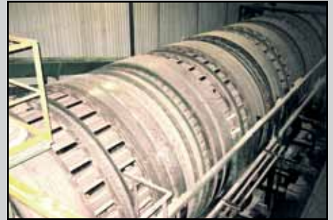
HUOT 97-029 60' DRUM DEBARKER