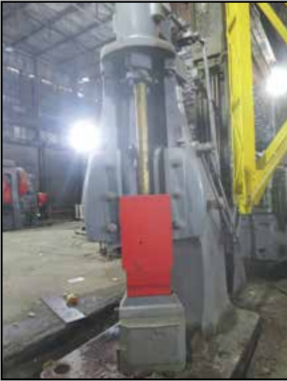
ERIE FORGING HAMMER