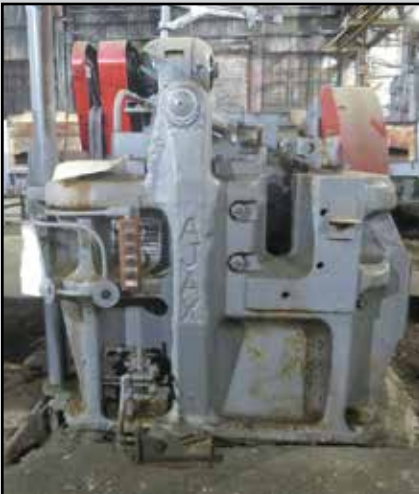
AJAX 2" UPSETTER