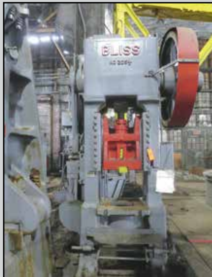
BLISS 113-TON MECHANICAL PRESS