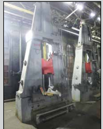
(2) ERIE FORGING HAMMERS