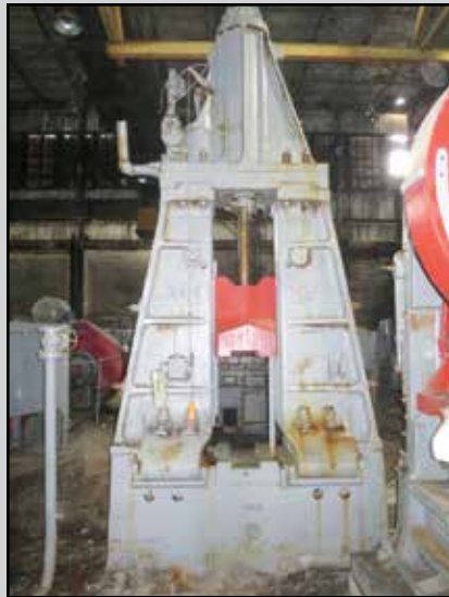
ERIE FOUNDRY COMPANY FORGING HAMMER