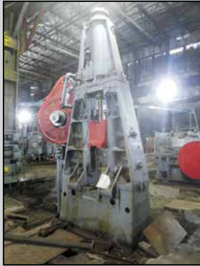
CHAMBERSBURG FORGING HAMMER