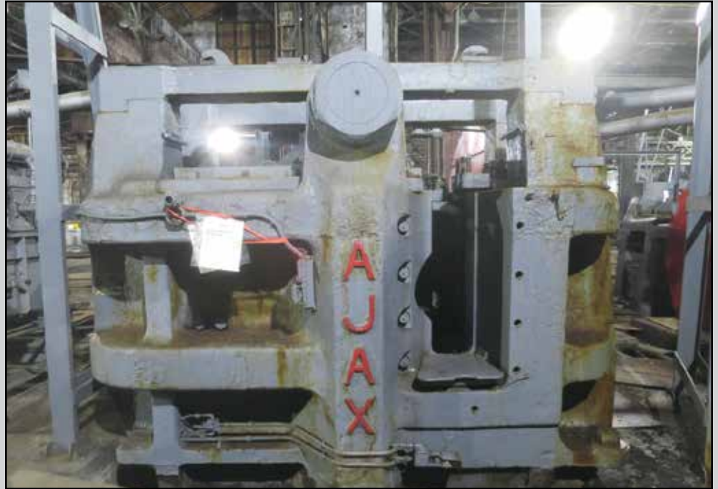
AJAX 8" UPSETTER