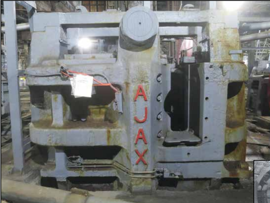
AJAX 8" UPSETTER