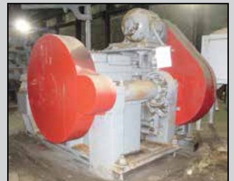
AJAX 2" UPSETTER (SIDE VIEW)

Do you have one piece of equipment or an entire plant that you would like appraised?