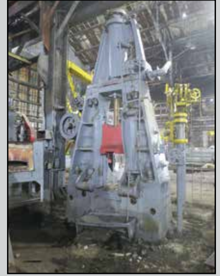
CHAMBERSBURG FORGING HAMMER