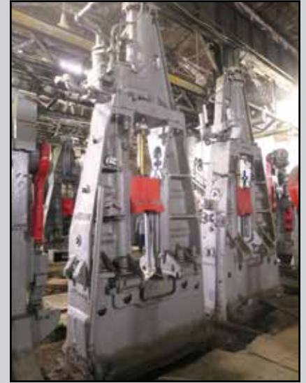
(2) ALLIANCE FORGING HAMMERS