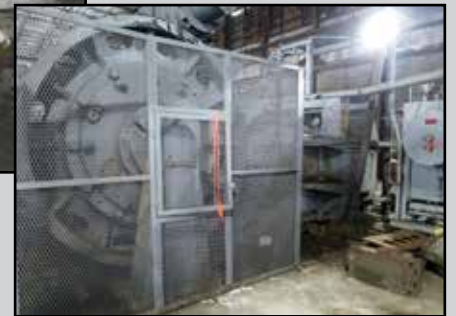
AJAX 8" UPSETTER (SIDE VIEW)

(4) AJAX 2" Mechanical Upsetters , 15 HP drives, 3-1/2" die opening, 14" die height, 2-1/2" die thickness, 60 SPM.