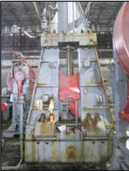
ERIE FOUNDRY COMPANY FORGING HAMMER