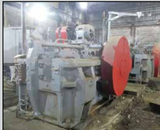
AJAX 2" UPSETTER