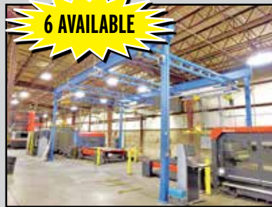
GORBEL BRIDGE CRANES