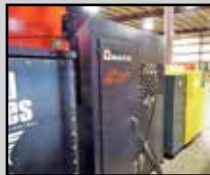
AMADA EZ-CUT NITROGEN GENERATOR