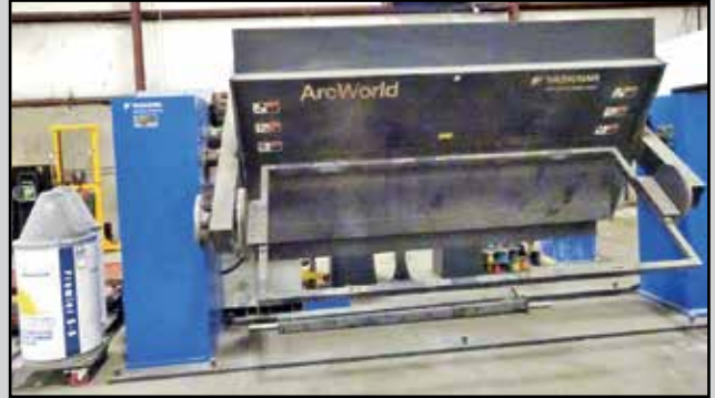
ARCMATE RM2 120" FERRIS WHEEL PLATE POSITIONER