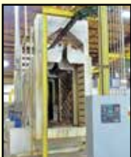
STAINLESS STEEL PAINT LINE WASHER