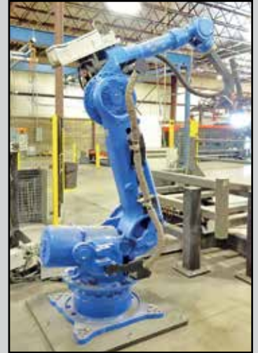
MOTOMAN ROBOTIC PLATE LOADER