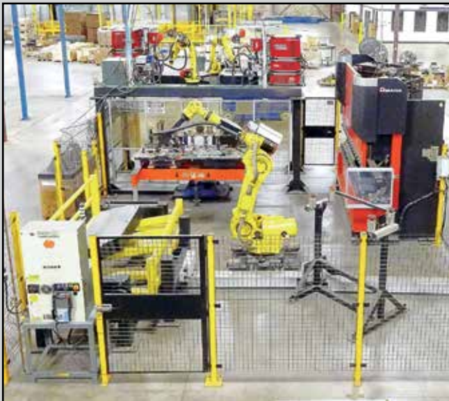
CNC PRESS BRAKE AND WELDING CELL

(2) 2012 AMADA HDS 1303 NT CNC 5-Axis Hydraulic Press Brakes, 126.8" x 130 mTon, with Motoman ES-165D 6-Axis CNC material handling robotic loader/unloader, 7' maximum reach articulating arm, EX100 robotic controls, teaching pendant, safety cage enclosure with interlock and safety light systems.