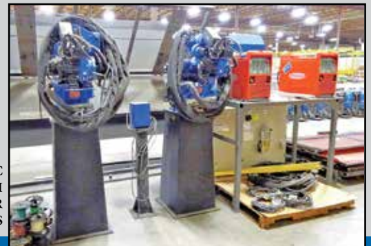
MOTOMAN ROBOTIC WELDERS WITH FRONIUS POWER SUPPLIES