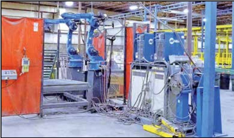
MOTOMAN ROBOTIC WELDING CELL WITH MILLER POWER SUPPLIES AND ROTARY POSITIONERS