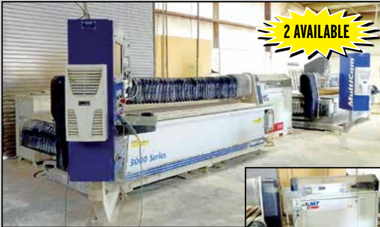
MULTICAM 3000 SERIES CNC WATER JET CUTTERS (1) WITH KMT STREAM LINE SL V-50 PLUS INTENSIFIER

Huge Selection of AMADA Press Brake Tooling, Welding Tables and Accessories, ANVER Vacuum Plate Lifters, Floor Fans, and Related Plant Machinery and Equipment! Must Be Seen!