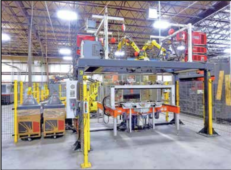
PRETEC CNC WELDING CELL