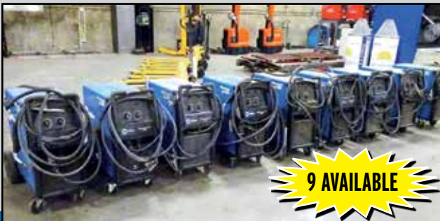
MILLER 252 WELDERS