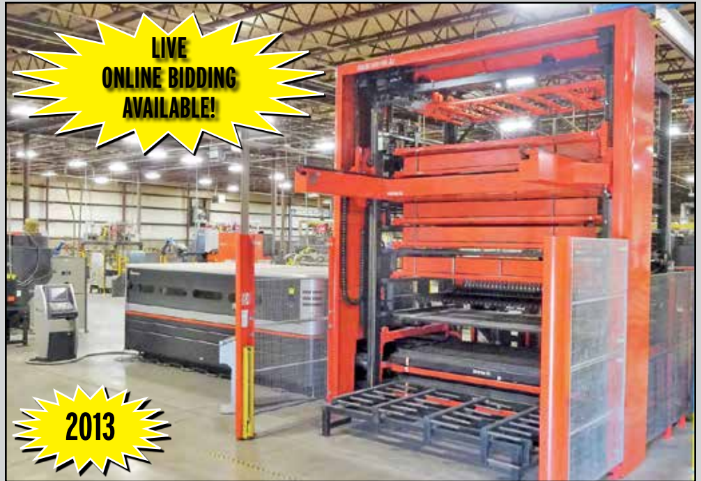
AMADA FOL 3015-AJ FIBER OPTIC CNC LASER WITH TOWER