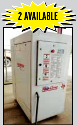
CHAMPION 50 HP ROTARY SCREW AIR COMPRESSORS