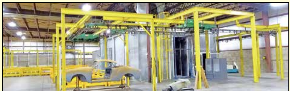
OVERVIEW OF PAINT LINE

Powder Paint Line Consisting of: 5" x 5" I-Beam structural steel conveyor on 12" x 12" floor mounted flanges, 14' on center uprights x 14' under beam height, drag chain transport conveyor with hangars, 18' x 60" floor mounted Roch power roller in-feed conveyor, Roch 20" x 60" roller feed accumulation conveyor, Roch auto index drag chain transfer shuttle table, 72" x 48" West Bend 1,500-lb. hydraulic scissor lift table, 40' stainless steel tunnel washer with 52" x 60" clear opening, 25' x 56' combination galvanized insulated panel system constructed dry-off/bake oven, gas fired, single pass drying side–double pass bake side, modular panel system constructed paint booth with Nordson powder paint system with iControls PLC.