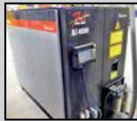
FIBER LASER POWER SUPPLY