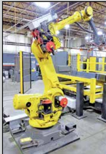
FANUC ROBOTIC LOADER WITH SHEET MAGAZINE