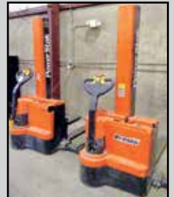
(2) PRESTO 2,200-LB. CAPACITY WALK-BEHIND PALLET LIFTS

Powder Paint Line Consisting of: 5" x 5" I-Beam structural steel conveyor on 12" x 12" floor mounted flanges, 14' on center uprights x 14' under beam height, drag chain transport conveyor with hangars, 18' x 60" floor mounted Roch power roller in-feed conveyor, Roch 20" x 60" roller feed accumulation conveyor, Roch auto index drag chain transfer shuttle table, 72" x 48" West Bend 1,500-lb. hydraulic scissor lift table, 40' stainless steel tunnel washer with 52" x 60" clear opening, 25' x 56' combination galvanized insulated panel system constructed dry-off/bake oven, gas fired, single pass drying side–double pass bake side, modular panel system constructed paint booth with Nordson powder paint system with iControls PLC.