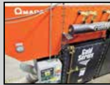
CAMFIL DUST COLLECTOR