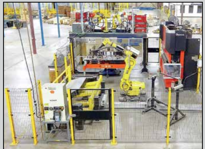
CNC PRESS BRAKE AND WELDING CELL