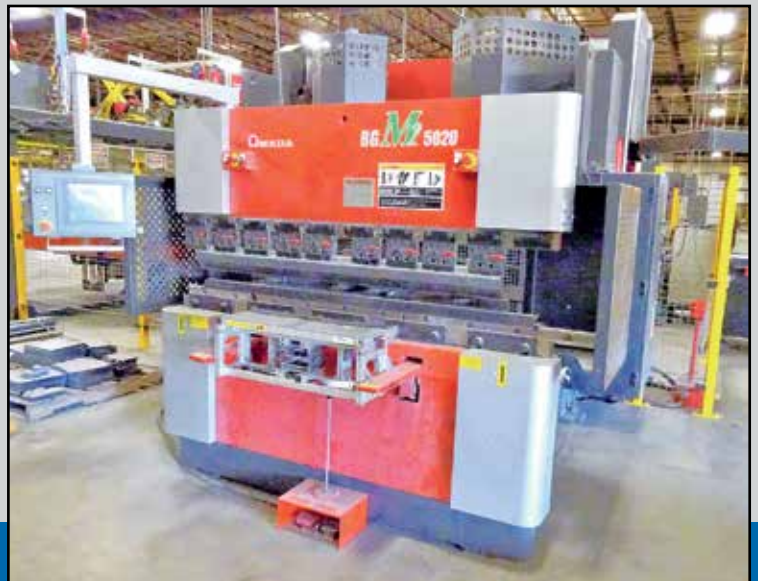
AMADA RGM2 5020 CNC PRESS BRAKE