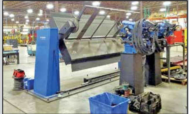
ROBOTIC WELDING CELL INCLUDING PLATE POSITIONER, (2) ROBOTS, (2) WELDING POWER SUPPLIES, LIGHT CURTAIN

LINCOLN POWER WAVE R-350 WELDING POWER SUPPLIES WITH TIG ADVANCED WELDING MODULES, COOL ARC 55 CHILLERS