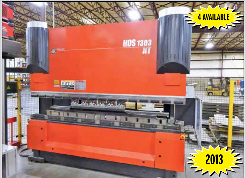
AMADA HDS 1303 NT 5-AXIS CNC PRESS BRAKES