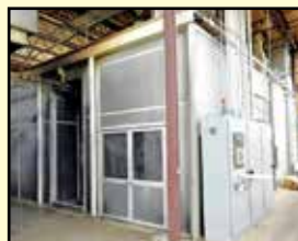
NORDSON PAINT BOOTH