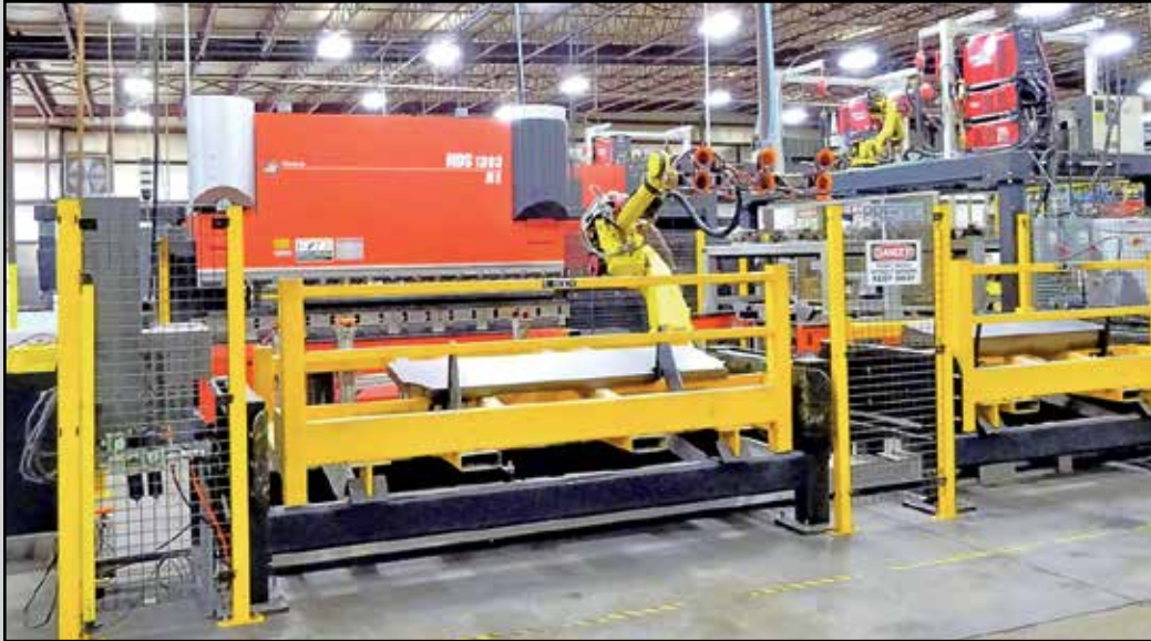
CNC PRESS BRAKE AND WELDING CELL WITH DUAL PLATE MAGAZINES