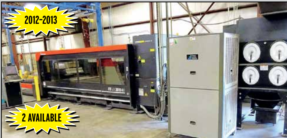
AMADA FO M-II 3015 NT CO2 LASER

2012 AMADA FO M-II 3015 NT CO2 5' x 10' 4,000 Watt Laser Cutting System, twin shuttle cutting pallets, Fanuc 4000 i-B resonator, Donaldson 4-canister dust collector with pulse cleaning, Orion QSQ 180 watt dryer, Kaeser Sigma CSD 75T rotary screw 75 HP air compressor with Precision Cooling Solutions refrigerated air dryer and vertical air receiver, safety light curtain, 13,450 total machine hours, 4,895 beam hours.