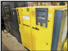
KAESER ASD40ST ROTARY SCREW AIR COMPRESSOR

2013 AMADA FOL 3015-AJ Fiber Optic CNC 4,000 Watt 5' x 10' Laser Cutting System, AJ 4000 oscillator, Orion QSB chiller, ASLUL-800F1 automatic tower load/unload system with (2) cutting pallets, (3) unload racks, and (3) material racks, EZ-Cut nitrogen generator, Farr GS4P dust collection system with pneumatic shakers, Kaeser ASD40 ST 30 HP rotary screw air compressor, safety light curtain and enclosure, 12,825 total machine hours, 6,752 operating hours, only 2,750 beam hours.