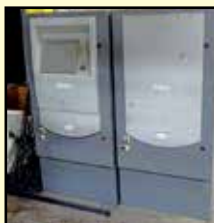
NORDSON PAINT LINE PLC CONTROLS