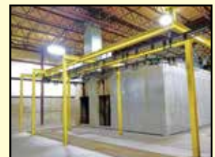
PAINT LINE OVEN (3 PASS)