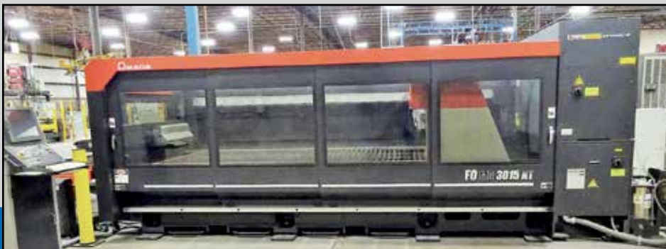
AMADA FO M-II 3015 NT CO2 LASER

2012 AMADA FO M-II 3015 NT CO2 5' x 10' 4,000 Watt Laser Cutting System, twin shuttle cutting pallets, Fanuc 4000 i-B resonator, Donaldson 4-canister dust collector with pulse cleaning, Orion QSQ 180 watt dryer, Kaeser Sigma CSD 75T rotary screw 75 HP air compressor with Precision Cooling Solutions refrigerated air dryer and vertical air receiver, safety light curtain, 13,450 total machine hours, 4,895 beam hours.