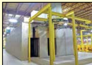
PAINT LINE OVEN