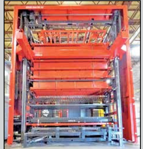
ASLUL-800F1 AUTOMATIC TOWER LOAD-UNLOAD SYSTEM