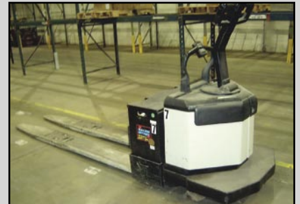
CROWN ELECTRIC PALLET JACK

(45+) Assorted Hydraulic Pallet Jacks, 4,500-lb.-5,500-lb. capacity.