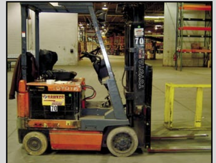
1997 TOYOTA ELECTRIC FORKLIFT, 36-VOLT