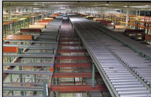
VIEW OF MEZZANINE