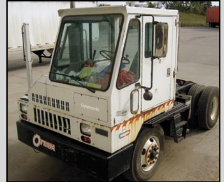
OTTAWA COMMANDO YARD JOCKEY