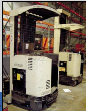
CROWN ELECTRIC DOUBLE REACH TRUCKS