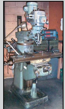
BRIDGEPORT VERTICAL MILLING MACHINE WITH DRO