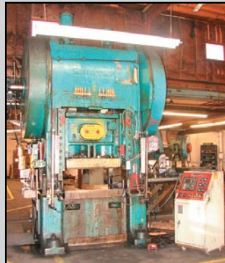
MINSTER 400-TON PRESS WITH SMART PRESS CONTROLS