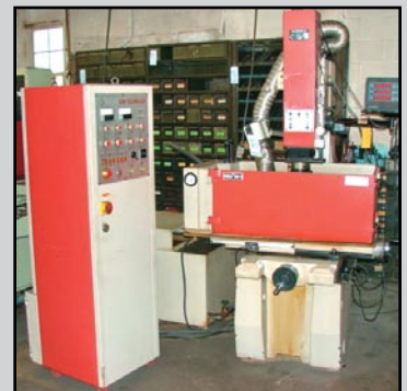
EDM WITH DRO