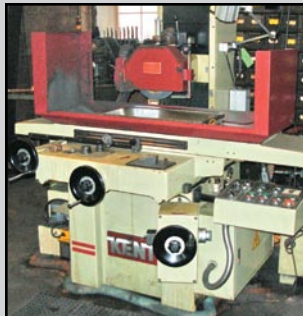
KENT AUTOMATIC HYDRAULIC SURFACE GRINDER