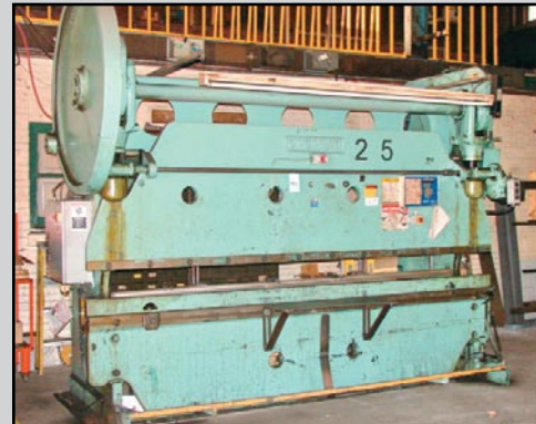
CINCINNATI 12' PRESS BRAKE