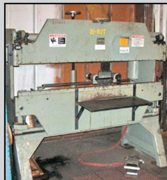
BANTAM PNEUMATIC BRAKE