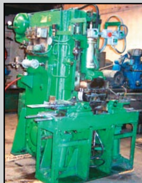
PINES HYDRAULIC BENDER