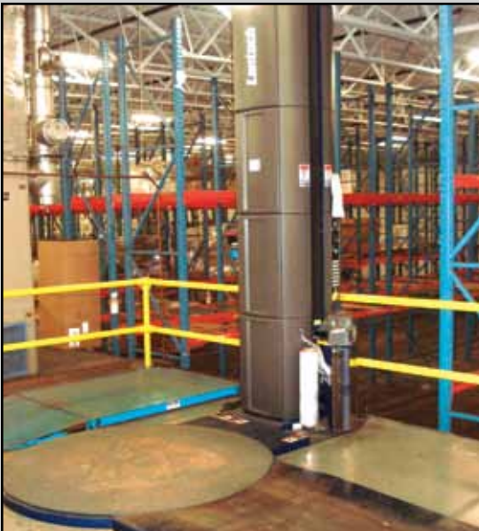
2007 LANTECH STRETCH WRAPPER Q300 SERIES