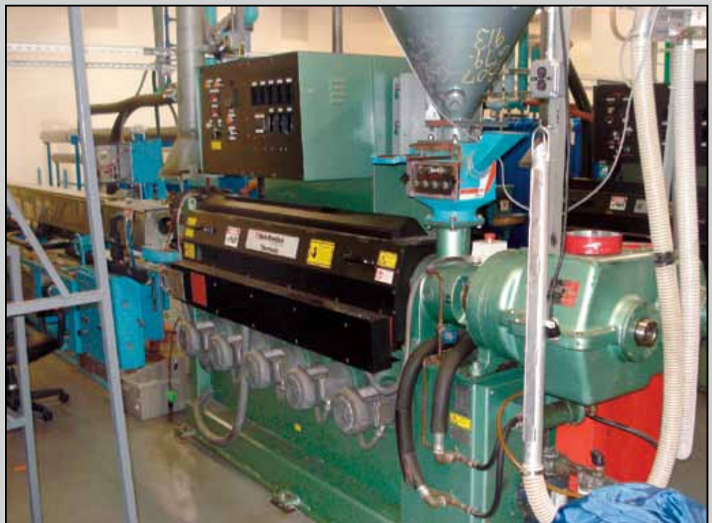
(1 OF 2) DAVIS STANDARD 2-3/4" HORIZONTAL PLASTIC EXTRUDERS