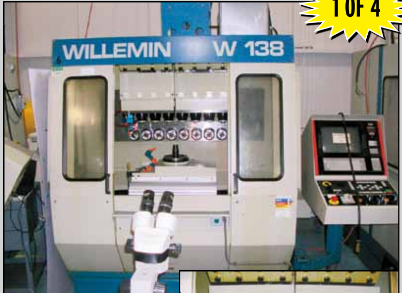
1998 WILLEMIM MODEL W 138 VERTICAL MACHINING CENTER