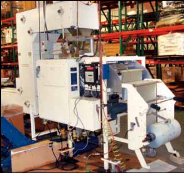
HAYSSZEN 95 16R SINGLE TUBE VERTICAL FORM FILL AND SEAL MACHINE