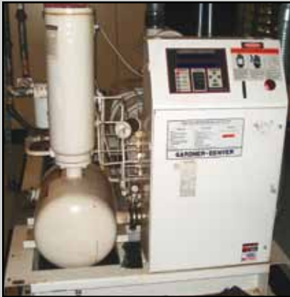
(1 OF 2) GARDNER DENVER 100 HP AIR COMPRESSORS