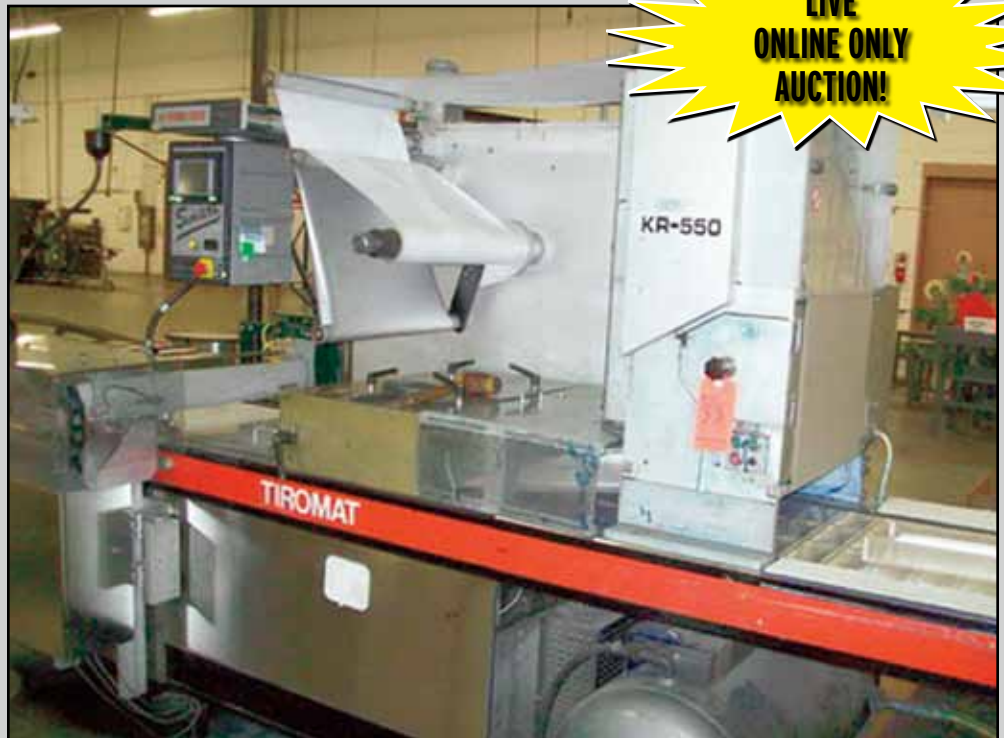
KRAMER-GREBE SS TIROMAT ROLLSTOCK VACUUM PACKAGING MACHINE