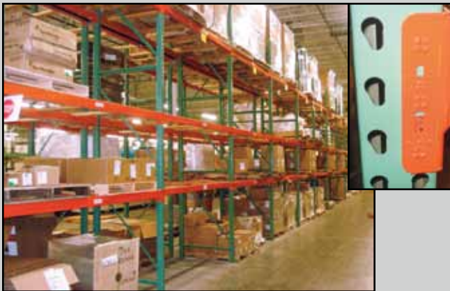
PARTIAL VIEW OF PALLET RACKING

(4) 1997 & 1998 WILLEMIN Mdl. W138 CNC Vertical Milling Machines, 4th axis, travels: X 31.5", Y 8.3", Z 6.3", spindle taper ISO 25, control num 750 spindles: horiz: 8, vert: 8, speed: Airflow Mist Pac cooling system and Transformer Specialties Inc. transformer. Willem specifications; Schema, 138-155, 2600 Kg, U/3X400, f/60Hz, I/20A, P/8 Kw. Transformer Specifications; 17.5 Kva, 3 PH, 50 Hz, Type ISO, HV 480, Amps 21 % 1Z, LV 380/400/420, 26 Amps WT, Class B, 12,000 RPM.