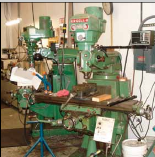
PARTIAL VIEW OF MACHINE SHOP