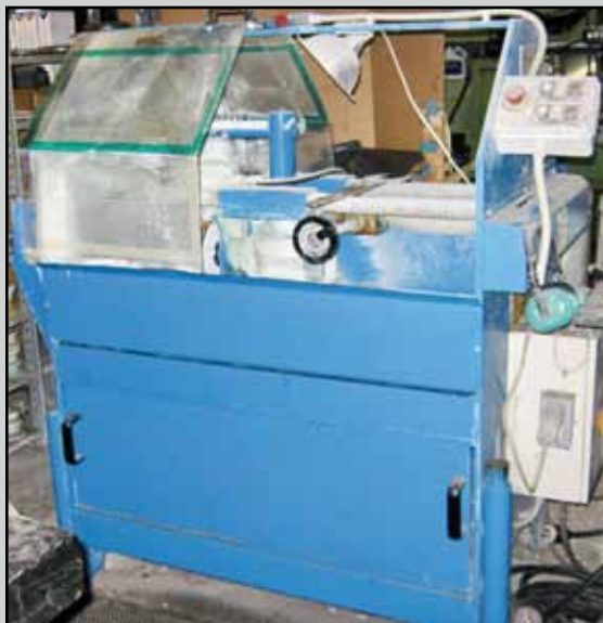
APUANIA R30 TOOL SHARPENER