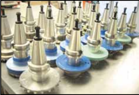
CNC TOOL HOLDERS