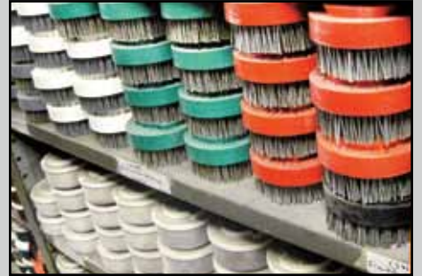
ASSORTED POLISHING WHEELS AND BRUSHES