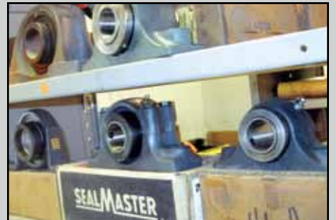
SAMPLE PILLOW BLOCK BEARING SETS