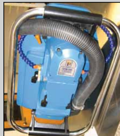
GISON EDGE ROUTER