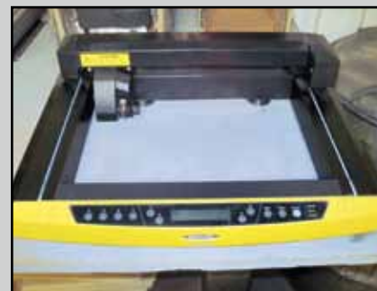
GRAPHTEC FLAT BED PLOTTER