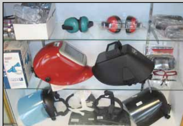
FACE GUARDS HEARING PROTECTION