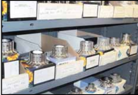
CNC PROFILING WHEELS