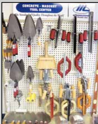
MASONRY HAND TOOLS