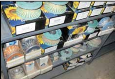
PROFILE FINISHING WHEELS