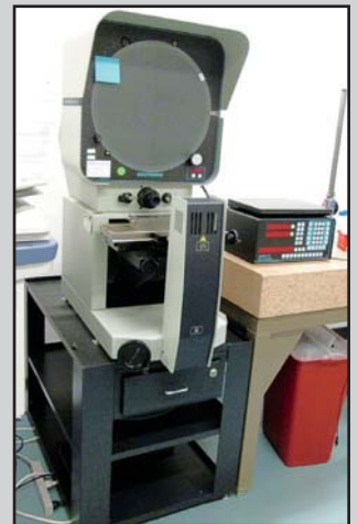
DELTRONIC OPTICAL COMPARATOR WITH DRO