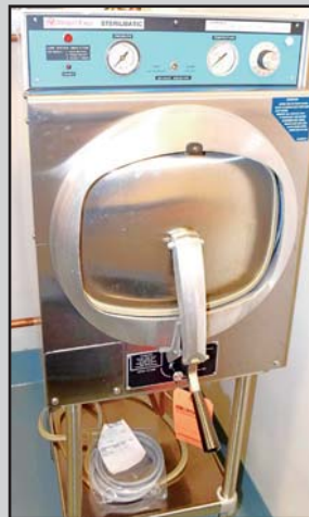
(1 OF 2) MARKET FORGE AUTOCLAVES