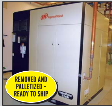
INGERSOLL-RAND IRN200H-OF 200 HP AIR COMPRESSOR