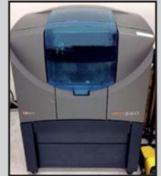
OBJET 3-D PRINTER