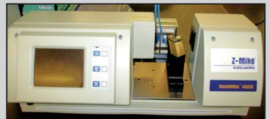
Z-MIKE BENCHTOP LASER MICROMETER

THERMATRON and VWR Stainless Steel Environmental Chambers.