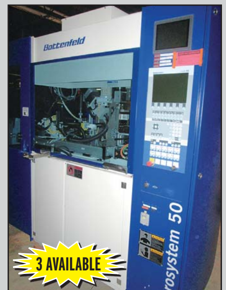
(1 OF 3) BATTENFELD MM50/50 MICRO PLASTIC INJECTION MOLDING MACHINES