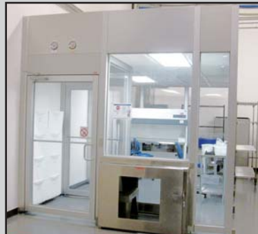
CLEAN AIR PRODUCTS CLEAN ROOM