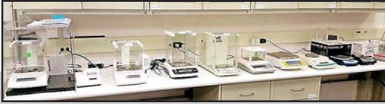
ASSORTED SCALES AND BALANCES

Very extensive selection of high end lab furniture and fixtures, lab hoods, biosafety cabinets, bench top lab equipment including vibratory hot plates, lab scales and balances, ovens and furnaces, video inspection systems, ultrasonic and water baths, water and air purifiers, pH meters, viscometers and mixers, analyzers and gauges, air samplers, and much more!