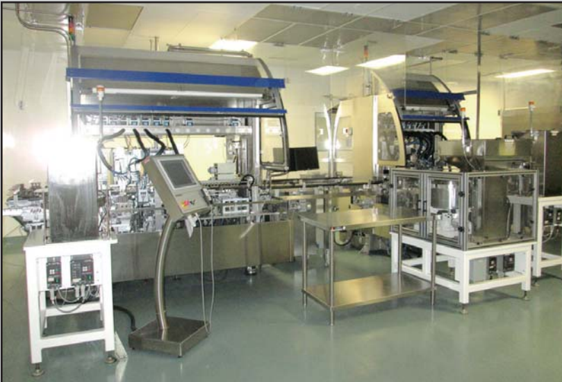
(2) MICRON FULLY ROBOTIC SYRINGE PRODUCTION LINES