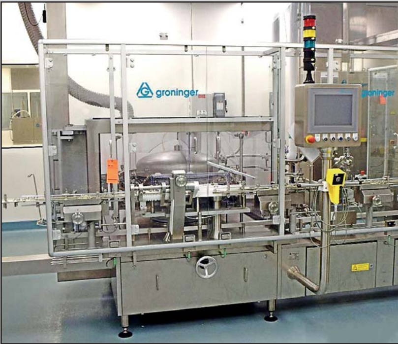
GRONINGER ROTARY SYRINGE VIAL CLEANER

OKAMATO Linear 618 Precision Surface Grinder.