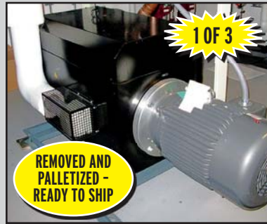
(1 OF 3) GARDNER DENVER VACUUM PUMPS