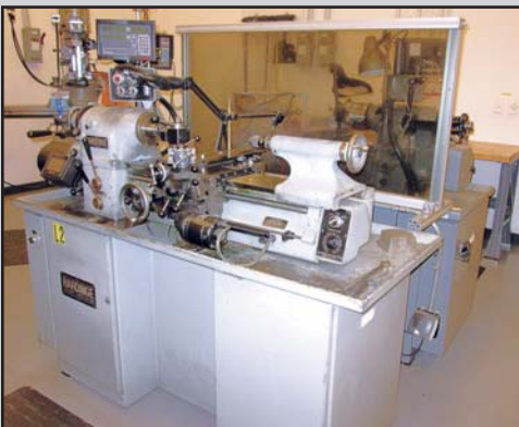
HARDINGE HLHV PRECISION TOOL ROOM LATHE