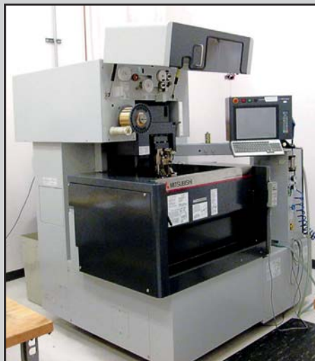
MITSUBISHI CNC WIRE EDM