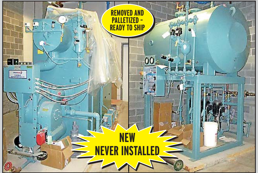
CLEAVER BROOKS FLX-700-600 STEAM BOILER

YORK/JOHNSON Controls Modular Air Handling Systems, unused.