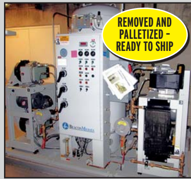
BEACON MEDICAL AIR COMPRESSOR SKID