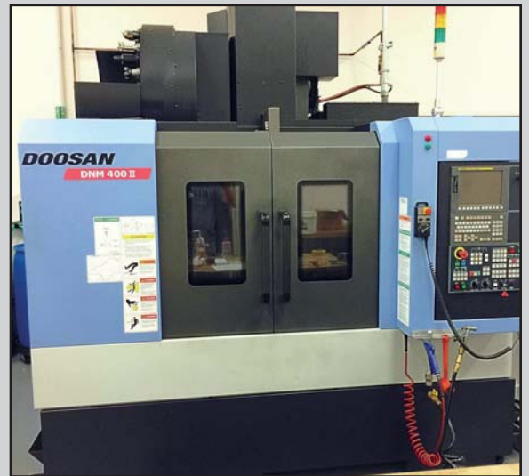
DOOSAN CNC VERTICAL MACHINING CENTER