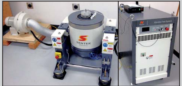
SENTEK DYNAMICS VIBRATION TESTER WITH CONTROLS

(2) Free-Standing Modular Clean Rooms, with pass-throughs and air locks.