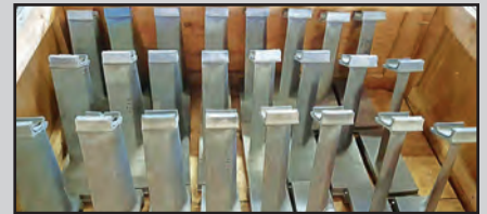
SIEMENS V84.2, ROW 3 VANES, P-N 02-8429-12-603 (PART OF COMPLETE SET)