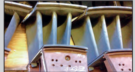
7FA ROW 3 NOZZLE/VANES