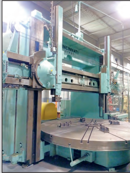
CINCINNATI HYPRO 144" VERTICAL LATHE