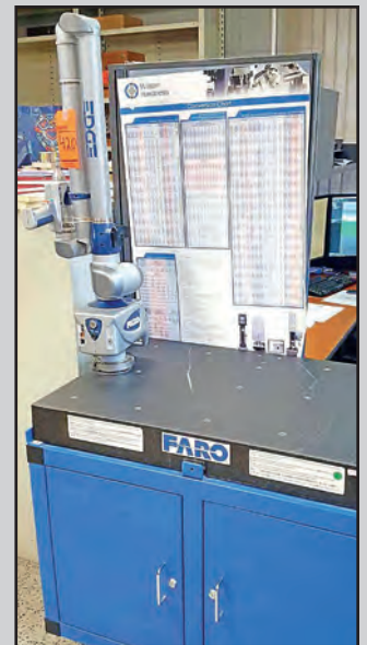
FARO EDGE LASER CMM

For complete catalog crgllc.com 1.800.300.6852