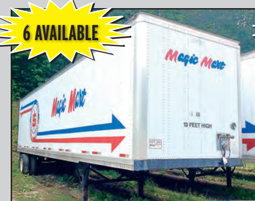
FRUEHAUF 39' S/A TRAILER

2008 GMC 16' Box Truck, AT, 6.0 liter engine, S/A, dual rears, cloth interior, AC, AM-FM, tow assist, roll up door.