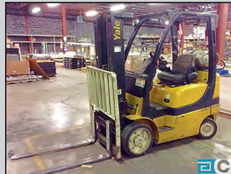
2010 YALE GLC050 LPG FORKLIFT