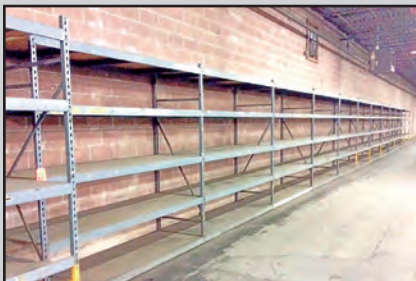
SAMPLE METAL SHELVING