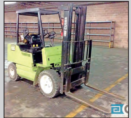
CLARK GPX230 LPG FORKLIFT