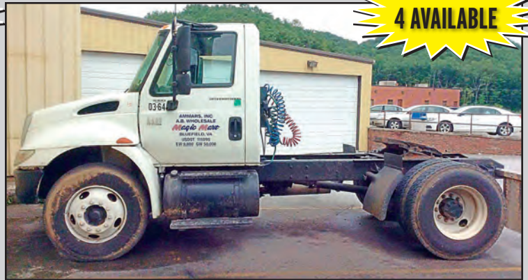
2007 INTERNATIONAL TRACTOR