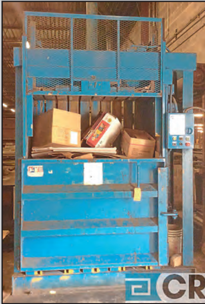
AMERICAN ENVIRONMENTAL PRODUCTS BALER