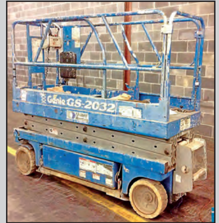
GENIE GS-2032 ELECTRIC SCISSOR LIFT