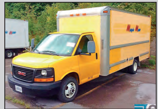
2008 GMC 16' BOX TRUCK