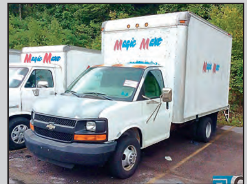
2005 CHEVROLET 12' BOX TRUCK

DATE: Online Only Bidding Closes Tuesday, October 23rd INSPECTION: Monday, October 22nd, from 9:00 A.M. – 4:00 P.M.