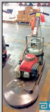
PIONEER ECLIPSE WALK-BEHIND FLOOR BUFFER

Large Quantity of Metal Shelving, Motorized Belt and Roller Conveyor, (40+) Assorted Warehouse Stock Extension, and Step Ladders, Floor Scrubbers and Buffers, (7) Electric Pallet Jacks, (34) Pallet Jacks, Shop Carts, Appliance Dollies, Paint Mixers and Shakers, and Much More.