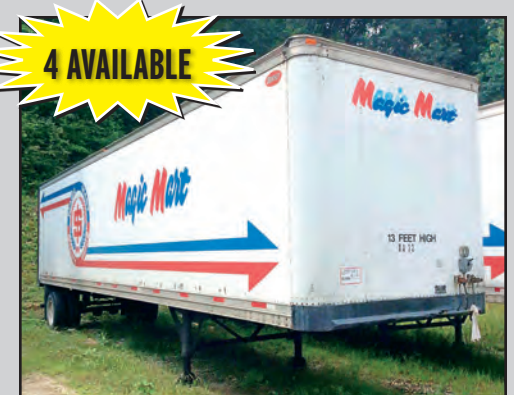
DORSEY 39' S/A TRAILER

1996 GMC 3500 10' Box Truck, AT, 5.7 liter engine, vinyl interior, AC, AM-FM, roll up door.