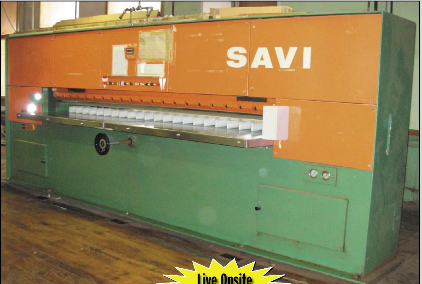
SAVI HFK-320 128" HYD. GUILLOTINE CUTTER