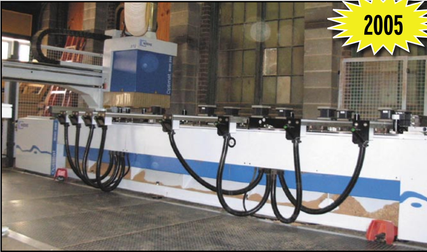
WEEKE OPTIMAT BHC-280 3/12 POINT-TO-POINT MACHINING CENTER