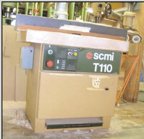
SCMI T-110 SINGLE-SPINDLE SHAPER