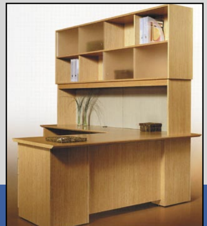
SAMPLE OF OFFICE FURNITURE