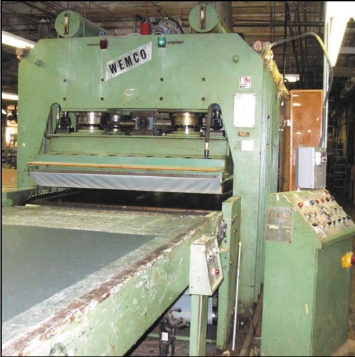
SERGIANI 8-POST HYDRAULIC DOUBLE-HEATED PLATEN LAMINATING PRESS