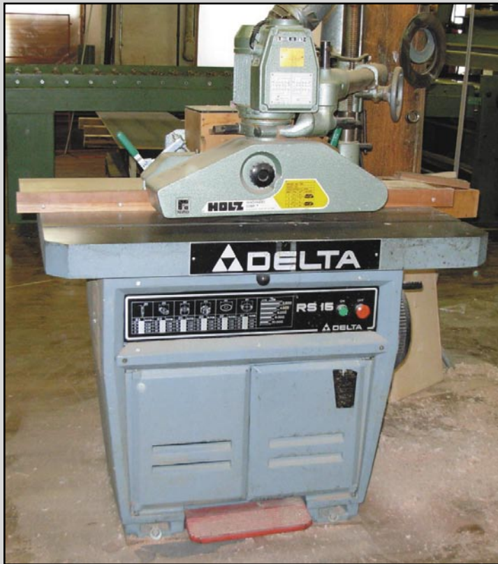
DELTA RS-15 SINGLE-SPINDLE SHAPER, w/HOLZ 3/4 HP FEEDER