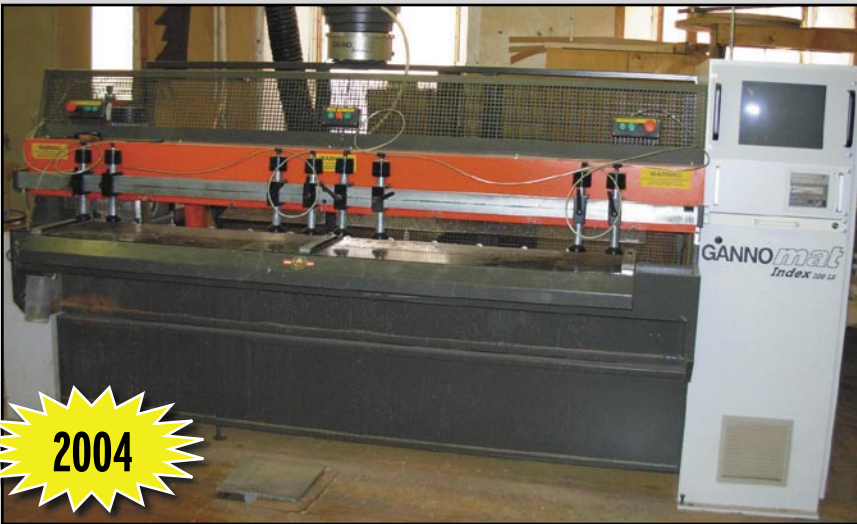
GANNO-MAT INDEX 200 LS CNC DRILLING & INSERTING MACHINE