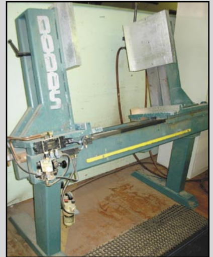
DODDS PNEUMATIC CASE CLAMP

Good Quantity of Hand Power Tools , including routers, chop saws, drills, clamps, and related.