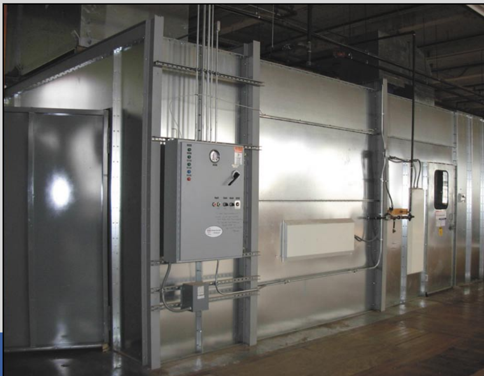
GLOBAL FINISHING SYSTEMS