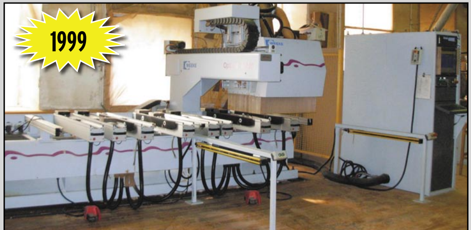
WEEKE BP-140 CNC POINT-TO-POINT MACHINING CENTER