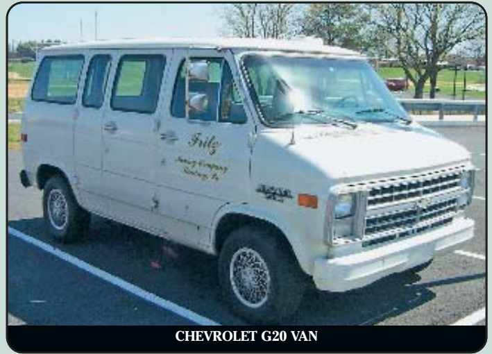
CHEVROLET G20 VAN