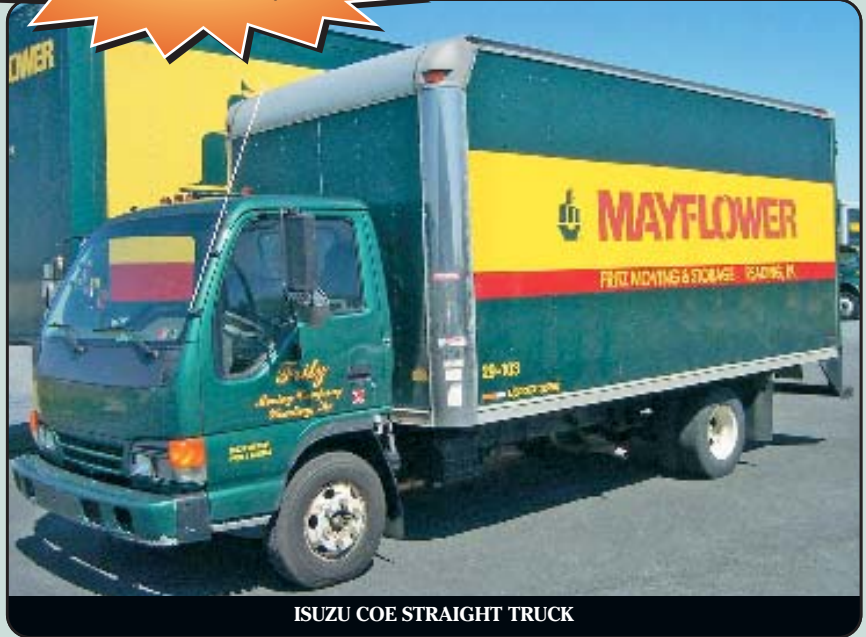
ISUZU COE STRAIGHT TRUCK