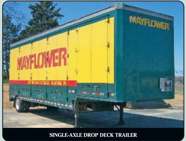
SINGLE-AXLE DROP DECK TRAILER

(15) Refrigerator Dollies; (100±) Carpeted and Rubber 4-Wheel Dollies; (3,000) Pads; (15±) MAGLINERS; Assorted Lumber; (90) Sections Heavy-Duty Pallet Racking, 42" d., 8' crossbars, 25'h.; Office Furnishings; Computers; Printers.