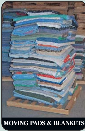
MOVING PADS & BLANKETS