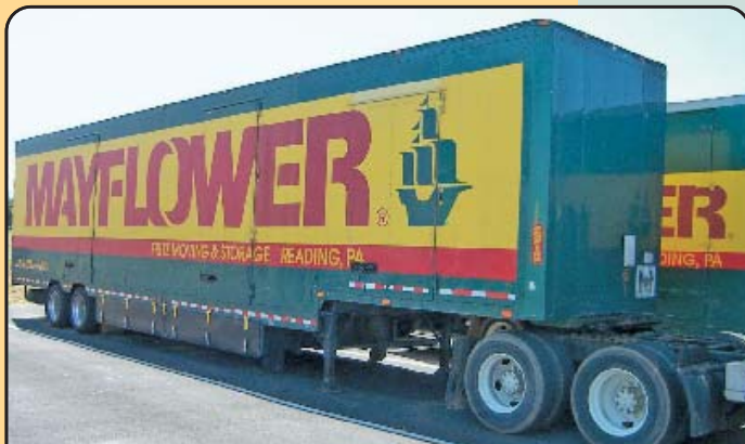
53' TANDEM-AXLE DROP DECK MOVING TRAILER

1981 GMC 25' , single-axle, hydraulic brakes, 5-speed transmission, 8.2T diesel engine, rear swing doors, 31,500-lb. GVWR, spring suspension.