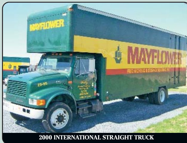
2000 INTERNATIONAL STRAIGHT TRUCK

The information described in this brochure is correct to the best of our knowledge, but we cannot guarantee same. It is for this reason that buyers should avail themselves of the opportunity for inspection prior to the sale. Everything is sold "as is," "where is." A 25% deposit to bid is required. All other terms and conditions to be announced at time of sale. A 10% buyer's premium applies.