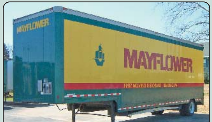
KENTUCKY 34' SINGLE-AXLE TRAILER