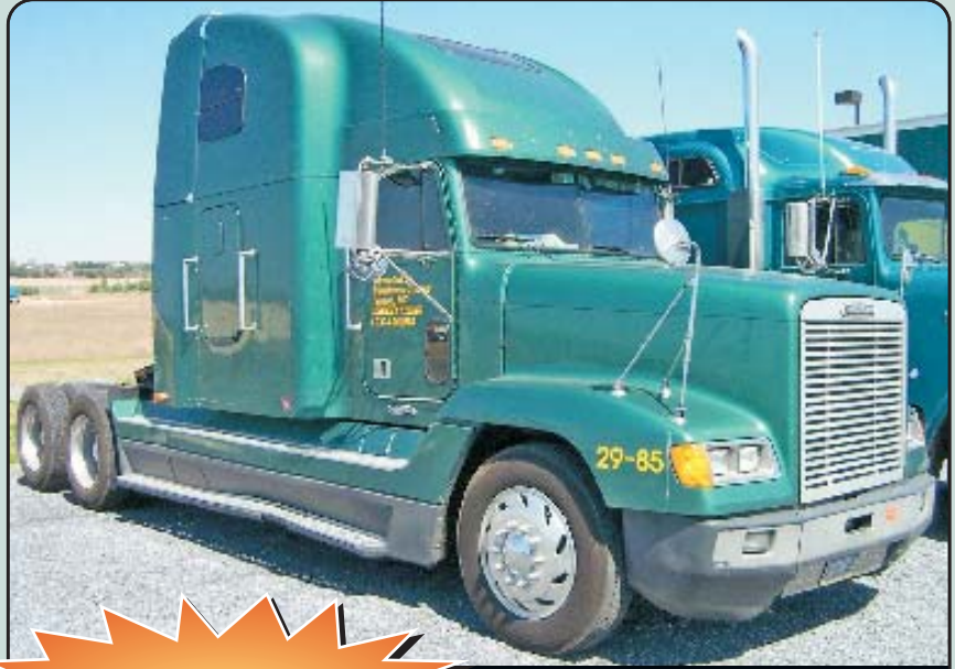
FREIGHTLINER TANDEM-AXLE SLEEPER