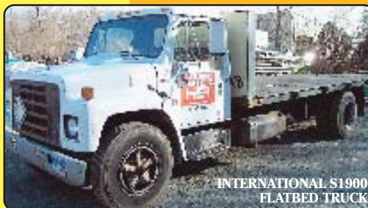
INTERNATIONAL S1900 FLATBED TRUCK

Inspection: 9:00 A.M. - 4:00 P.M. Day Before Each Sale