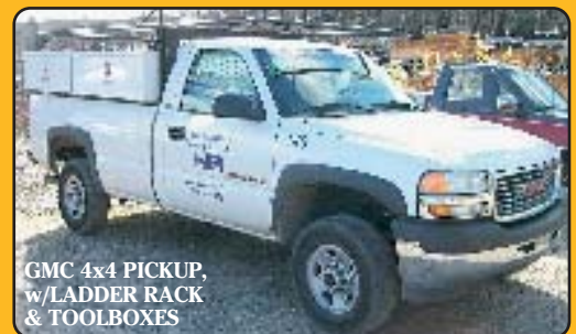
GMC 4x4 PICKUP, w/LADDER RACK & TOOLBOXES