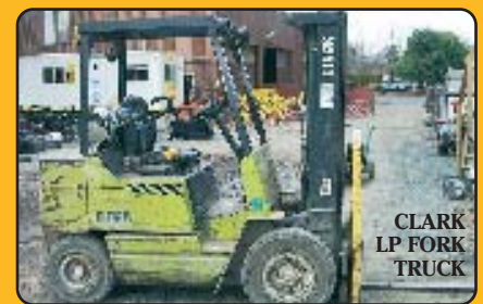
CLARK LP FORK TRUCK