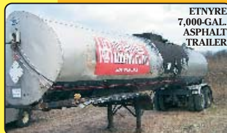
ETNYRE 7,000-GAL. ASPHALT TRAILER