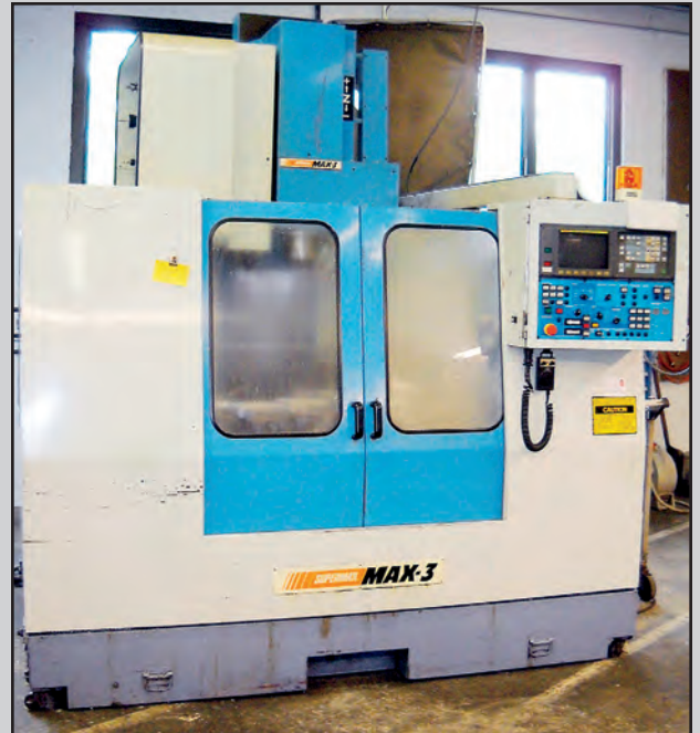
SUPERMAX MAX 3 CNC VERTICAL MACHINING CENTER