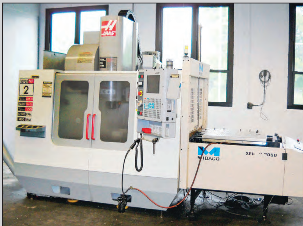
HAAS VF-2SS CNC VERTICAL MACHINING CENTER