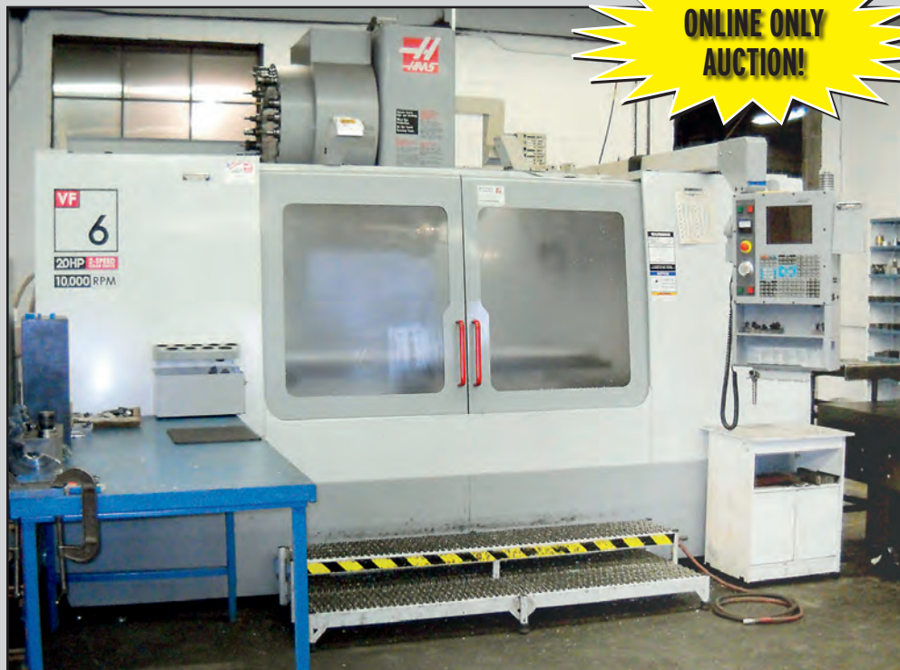
HAAS VF-6 CNC VERTICAL MACHINING CENTER