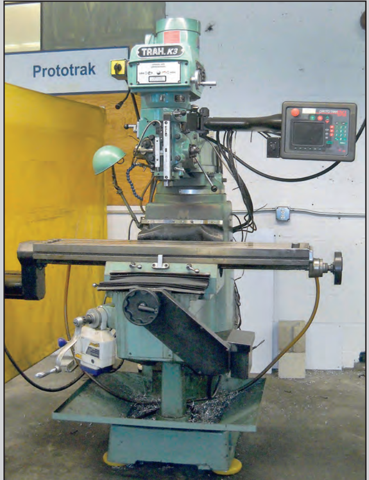
TRAK K-3 CNC VERTICAL MILLING MACHINE

To be sold in accordance with CRG Terms of Sale as published on our website and in the auction catalog. A buyer's premium will apply.