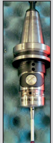
(1 OF 2) RENISHAW PROBE HEAD IN #40 T TOOL HOLDER

2003 HAAS TL-1 CNC Lathe, S/N 66777, 24" swing over bed x 36" BC, Rexroth hardened steel bed ways, hydraulic tail stock, 2-axis CNC controls, steady rest.