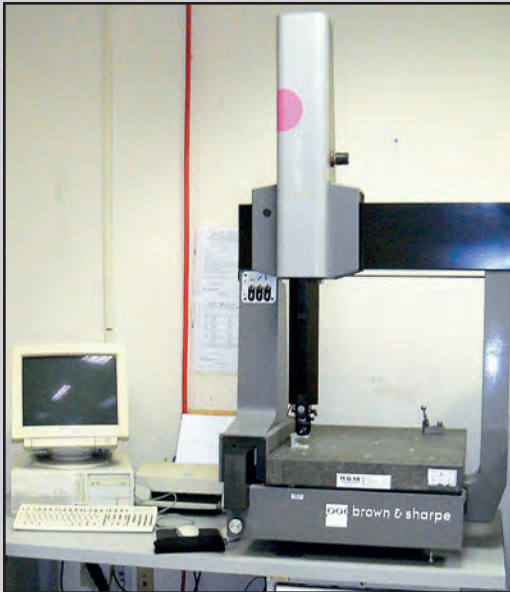
BROWN & SHARPE GAGE 2000 CMM