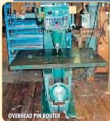
OVERHEAD PIN ROUTER

Finished & Unfinished Inventory Over 2,500 Ash Wood Baskets & Boxes