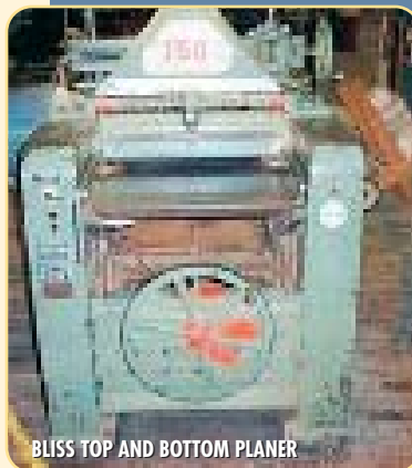
BLISS TOP AND BOTTOM PLANER