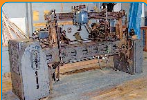
RICHARDSON CUT CHUCK BORE MACHINE