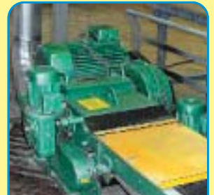
30 HP. WOOD HOG CHIPPER