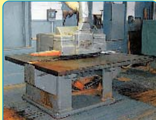
MATTISON 404 RIP SAW

Very Good Quantity of Shop and Stock Carts; Finishing and Painting Equipment; Drying Racks; Material Handling Equipment; Related.