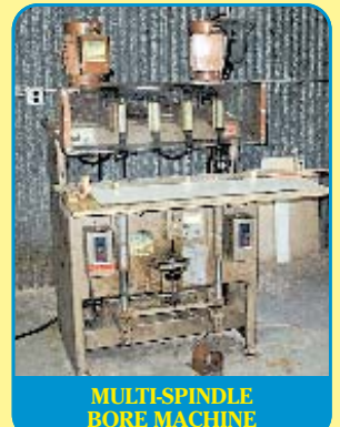
MULTI-SPINDLE BORE MACHINE