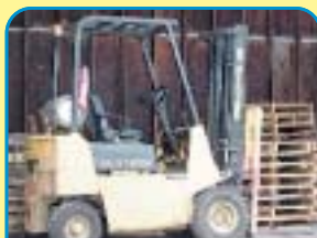
HYSTER FORK TRUCK

Very Good Quantity of Hardware Including Brass Hinges; Fasteners; Wood Screws; Nuts and Bolts; Pulls and Handles; Blackboards; Chalk and Paint Sets; Related Children's Toy Components and Supplies.