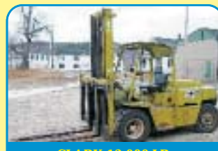
CLARK 12,000-LB. FORK TRUCK