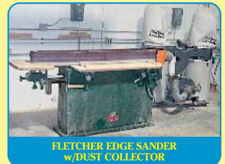
FLETCHER EDGE SANDER w/DUST COLLECTOR