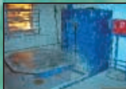
48 x 48 2-AXIS ROTO CASTING MACHINE