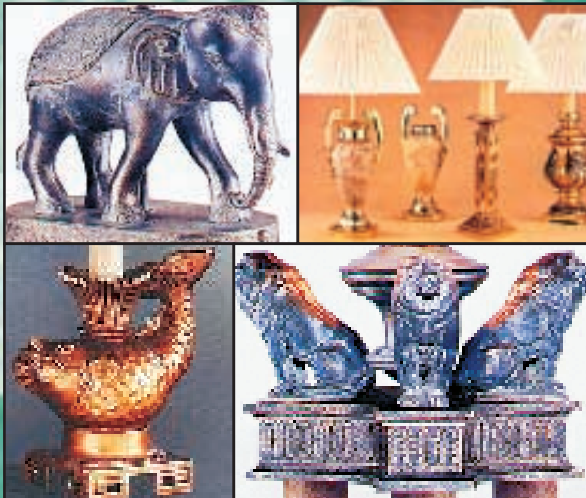
SAMPLES OF FINISHED PRODUCTS