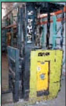
(1 OF 2) CLARK ORDER PICKERS

The information described in this brochure is correct to the best of our knowledge, but we cannot guarantee same. It is for this reason that buyers should avail themselves of the opportunity for inspection prior to the sale.