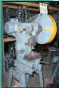
(5) ASSORTED 2-TON ELECTRIC PUNCH

Inspection: Morning of Sale, 8:00 A.M. – 10:00 A.M.