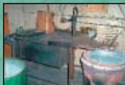
MELTING POT 250-LB. CAP 1