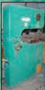
DoALL METAL MASTER BAND SAW

Inspection: Morning of Sale, 8:00 A.M. – 10:00 A.M.