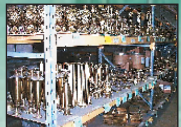
ASSORTED BRASS LAMP BASES