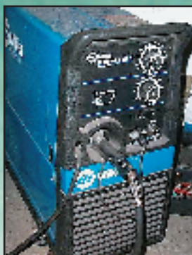
MILLER MILLERMATIC 250 WELDER