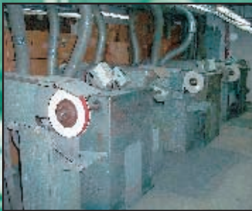
(7) ASSORTED DOUBLE-END BUFFER GRINDERS