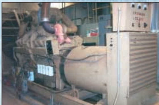
CUMMINS DIESEL BACKUP GENERATOR

For more information, log on to www.crgauction.com or www.rabin.com