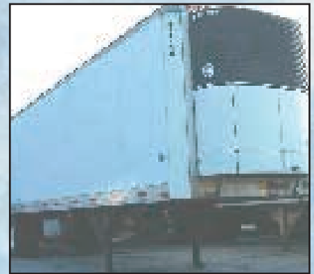
1997 UTILITY 42' REEFER