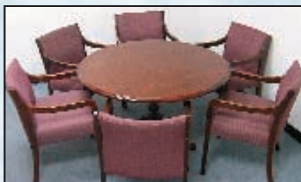
CONFERENCE ROOM FURNITURE