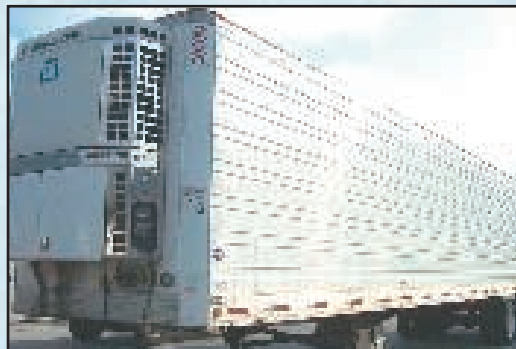
2001 UTILITY 48' REEFER

Preview: Monday April 28th 9:00 A.M. to 4:00 P.M.