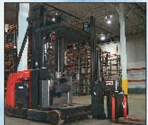
2002 RAYMOND TURRET LIFT