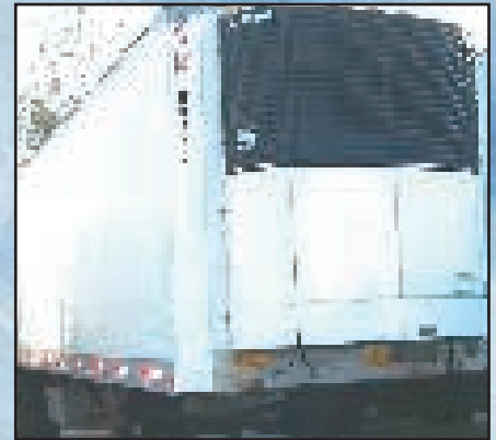
1996 UTILITY SINGLE-AXLE w/CARRIER REEFER

(47) 1994-1996 Assorted TRAILMOBILE and UTILITY 40'-46' Trailers , w/Carrier Ultra Fresh or Thermo King SB II reefer units and hydraulic rail gates.