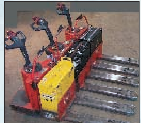
WALK-BEHIND PALLET JACKS