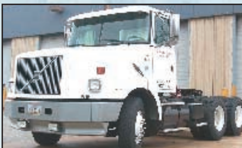
VOLVO TANDEM-AXLE DAY CAB