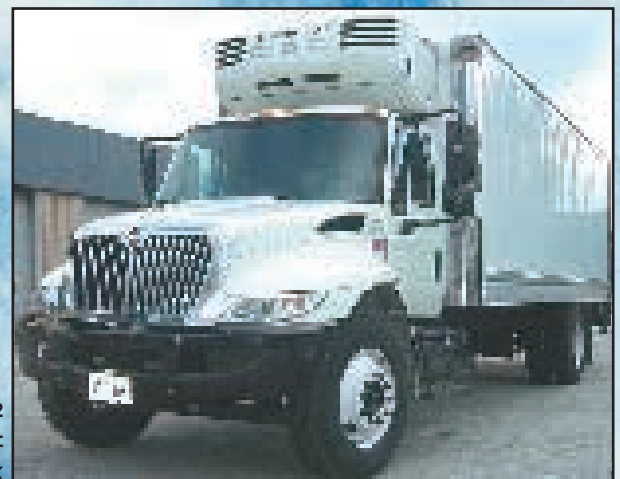
2002 INTERNATIONAL 24' STRAIGHT TRUCK

PLUS MULTIPLE LOCATIONS THROUGHOUT CALIFORNIA, COLORADO, MICHIGAN & TEXAS Thursday, May 1st–Friday, May 9th