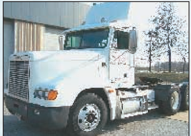
1996 FREIGHTLINER TANDEM-AXLE DAY CAB