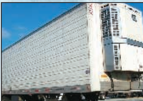
2001 UTILITY SINGLE-AXLE REEFER

Preview: Monday April 28th 9:00 A.M. to 4:00 P.M.