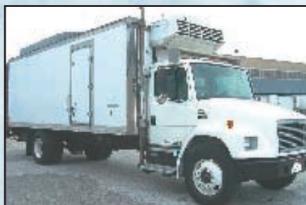
1997 FREIGHTLINER FL80 STRAIGHT TRUCK