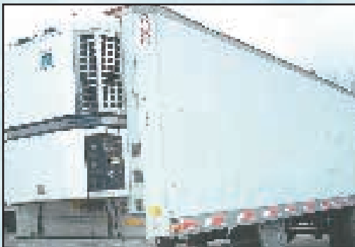
1997 UTILITY VS1R 28' REEFER