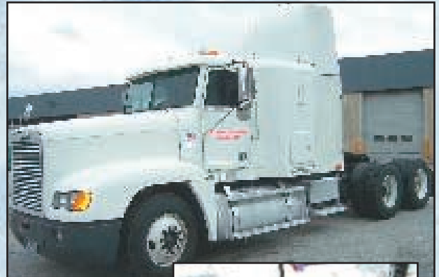
1997 FREIGHTLINER FLD12064ST SLEEPER CAB

(3) 1996 FREIGHTLINER Mdl. FLD12064ST T/A Day Cabs , w/Detroit Diesel Series 60 11.1L 402 hp. engines, Eaton Fuller 10-spd. trans., 40,000-lb. rears with Air Ride, Jake brake, sliding 5th-wheel, Tripmaster Datatrax Series II GPS, 11R22.5 tires on steel wheels, twin 150-gal. aluminum tanks, single-chrome stack, exterior visor, with aluminum deck plates.