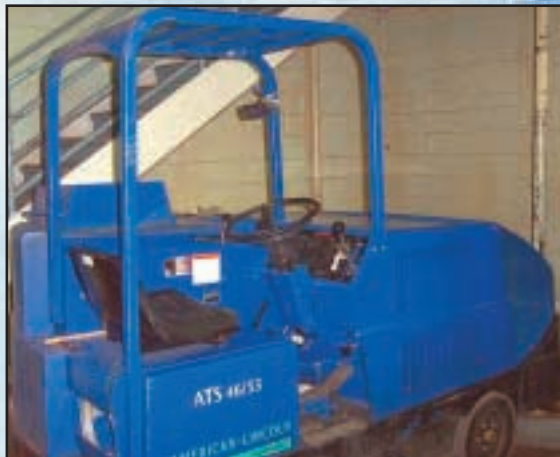
AMERICAN LINCOLN FLOOR SCRUBBER