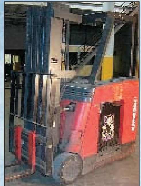
STAND UP FORK TRUCK W/SIDESHIFT

Good Quantity of Wood, Veneer, Laminated and Metal Executive Office Suites; Leather Executive and Side Chairs; Conference Room Furniture; Rolling Multi-Task Arm Chairs; Reception Room Furniture; Upright and Lateral Files; Office Panel Systems; Computer Work Stations; 2-Door Metal Storage Cabinets, and More.