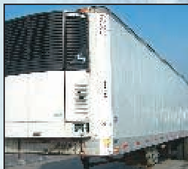
45' UTILITY w/CARRIER REEFER