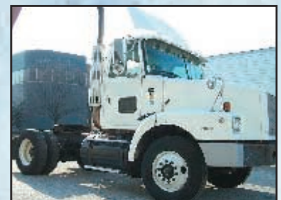
1997 VOLVO SINGLE-AXLE