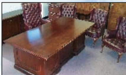
EXECUTIVE OFFICE SUITE

350+ Late Model Well Maintained Highway Tractors, Straight Trucks & Reefer Trailers (2) Fully Equipped Distribution Centers