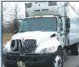
2001 INTERNATIONAL STRAIGHT TRUCK

(2) 1997 FREIGHTLINER FL80 , w/5.9L 210 hp. engines, Eaton Fuller 6-spd. trans., 35,000-lb. GVWR, Tripmaster Datatrax Series II GPS, 11R22.5 tires on steel wheels, twin 55-gal. steel tanks, cruise control, ABS, single stack, with 24' Morgan aluminum body, Thermo King KD-II reefer unit with remote display, and Maxon 5,500-lb. hydraulic rail gates and curbside swing door.