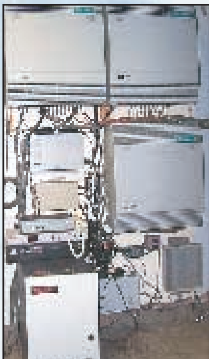
MERIDIAN PHONE SYSTEM