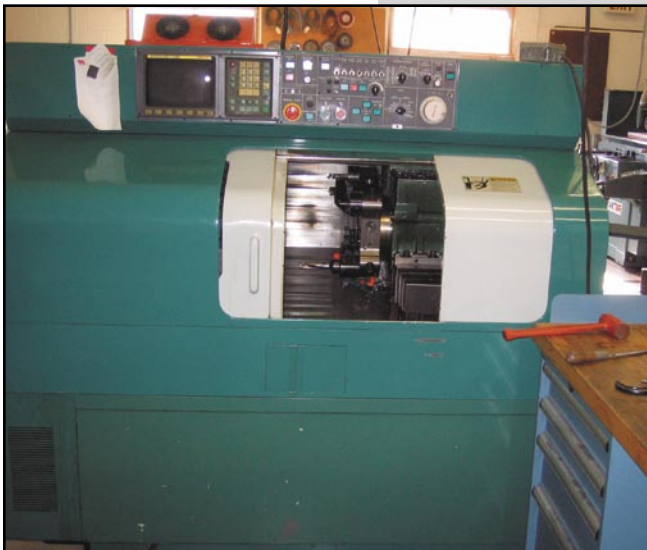
NAKAMURA TMC15 TURNING CENTER