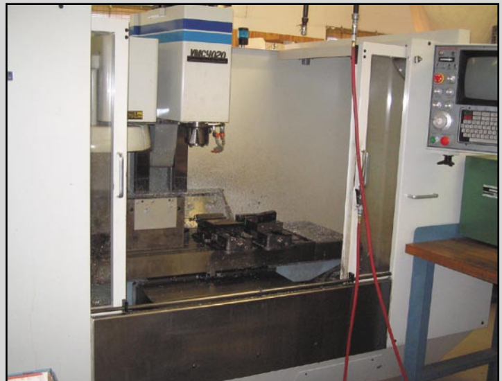
FADAL VMC 4020 VERTICAL MACHINING CENTER