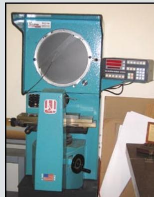
J&L TEC 14 OPTICAL COMPARATOR