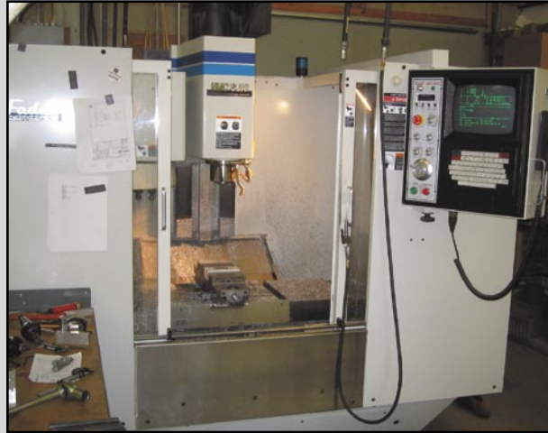
FADAL VMC 3016 VERTICAL MACHINING CENTER