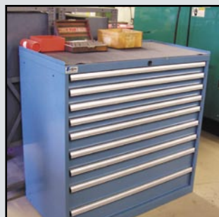
LISTA 9-DRAWER CABINET

Good Quantity of Assorted Inspection Equipment Including SUNNEN Bore Gages, w/setting fixtures; Pin Gages; Height Gages; Micrometers; Calipers; V-Blocks; Etc.