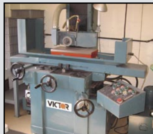
VICTOR 1020 AUTOMATIC SURFACE GRINDER

Surface Grinders; Disc Sanders; Belt Sanders; Drill Presses; Bench Grinders; 20-Ton Hydraulic Press; Arbor Presses; LISTA 9-Drawer Cabinet, (4) LISTA Workbenches; Etc.