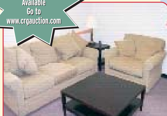
DESIGNER OFFICE FURNISHINGS

Can't Attend? Online Bidding Available Go to www.crgauction.com