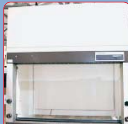
LABCONCO FUME HOOD