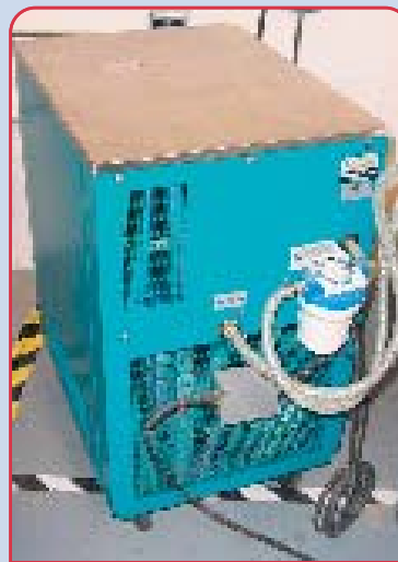
LYNTRON RE-CIRCULATING WATER CHILLER

The information described in this brochure is correct to the best of our knowledge, but we cannot guarantee same. It is for this reason that buyers should avail themselves of the opportunity for inspection prior to the sale.