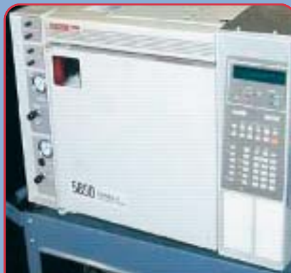
HEWLETT-PACKARD 5890 SERIES II GAS CHROMATOGRAPH

OMEGA and ASCO Red-Hat Electronic Valves.