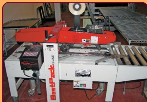
BEST PACK CARTON SEALER

WORLD FOODS INC. Saco, Maine Tuesday, May 10th Starting at 10:00 A.M.