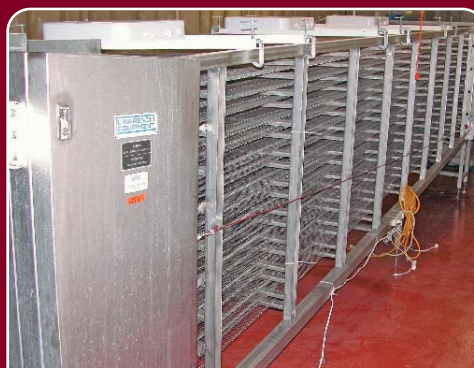
LAWRENCE COOLING 9-TIER STAINLESS STEEL CONVEYOR