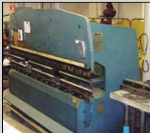
AMADA CNC BRAKE

FEELER Series II Hardinge HC Style Chucking Lathe. NARDINI MS1640E Lathe.