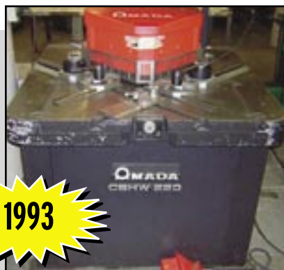
AMADA HYDRAULIC CORNER NOTCHER