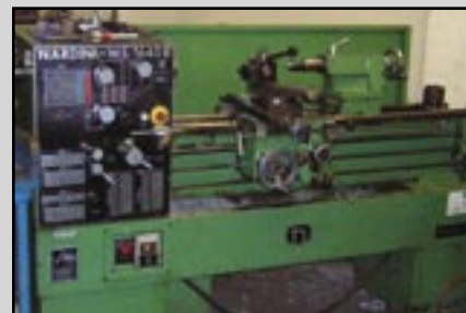
NARDINI MS1640E LATHE

WIEDEMANN RA-41 20-Station Turret Punch, manual controls and tooling.