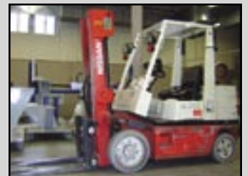
NISSAN LP FORKLIFT