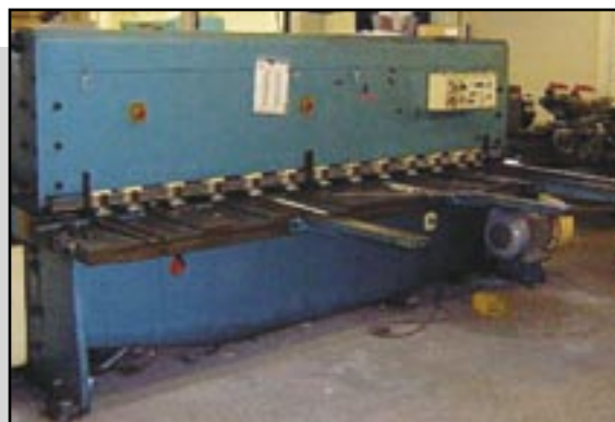
AMADA SHEAR, w/CNC BACK GAUGE