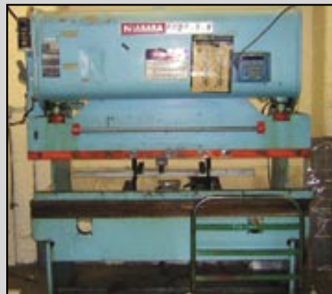
NIAGARA 1B25-5-6 PRESS BRAKE