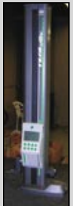
24" DIGITAL HEIGHT GAGE

To be sold in accordance with CRG Terms of Sale as published on our website and in the auction catalog. A buyer's premium will apply.