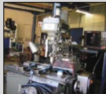
MILLPORT 2-AXIS CNC KNEE MILL, w/ANILAM SERIES 1100 CONTROL