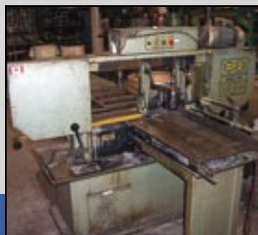
HYD-MECH S-20 HORIZONTAL BAND SAW

For complete catalog go to crgauction.com or call 1.800.300.6852