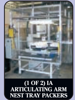
(1 OF 2) IA ARTICULATING ARM NEST TRAY PACKERS