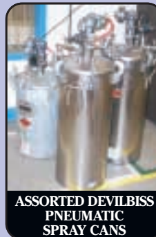
ASSORTED DEVILBISS PNEUMATIC SPRAY CANS