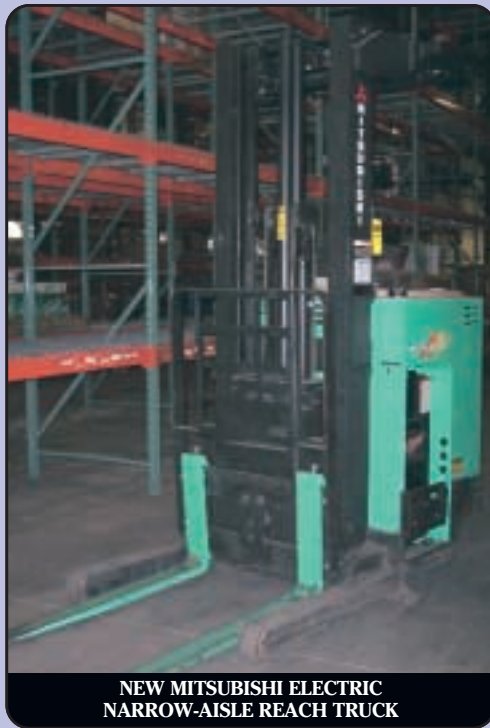
NEW MITSUBISHI ELECTRIC NARROW-AISLE REACH TRUCK

New 2004 INTERNATIONAL 4300 Diesel 25' Aluminum Box S/A Truck, Detroit diesel DT466 215 hp. engine, Eaton Fuller 6-spd. transmission, cruise control, only 7,900 miles!