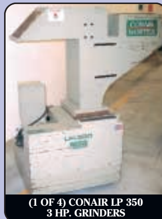
(1 OF 4) CONAIR LP 350 3 HP. GRINDERS