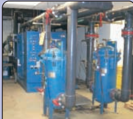
PROCESS WATER CHILLER AND FILTER SYSTEM