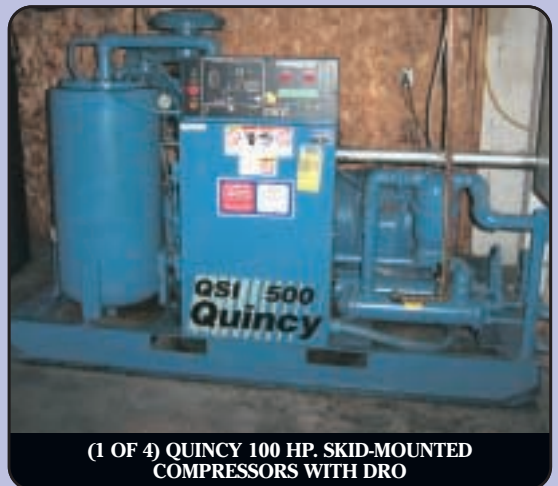
(1 OF 4) QUINCY 100 HP. SKID-MOUNTED COMPRESSORS WITH DRO