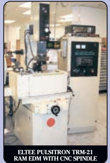
ELTEE PULSITRON TRM-21 RAM EDM WITH CNC SPINDLE

Can't Attend? Online Bidding Available. Go to www.crgauction.com