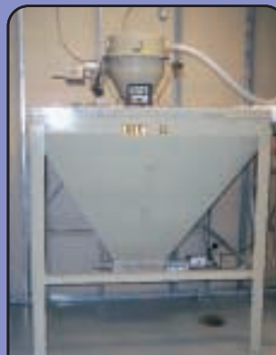
(1 OF 2) PLASTIC SILOS FOR CENTRAL LOADING SYSTEMS