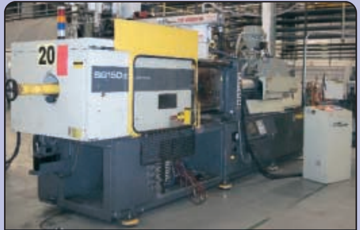
(1 OF 3) SUMITOMO SG-150 INJECTION MOLDING MACHINES