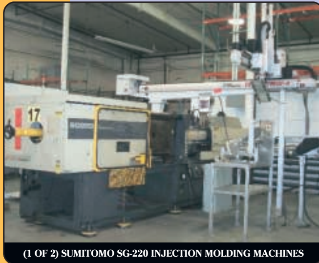
(1 OF 2) SUMITOMO SG-220 INJECTION MOLDING MACHINES