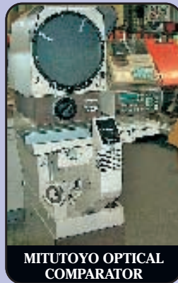
MITUTOYO OPTICAL COMPARATOR