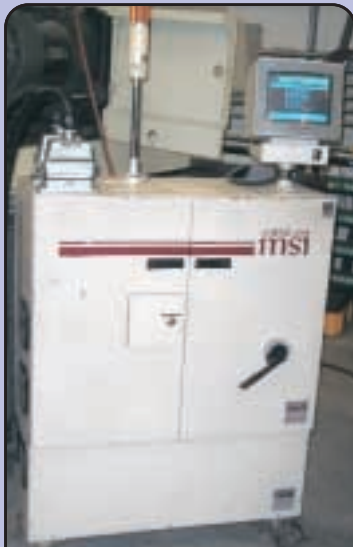
(1 OF 3) MSI 24-ZONE COMPUTERIZED HOT RUNNER CONTROLS W/TOUCHSCREEN

Late-Model Closed Loop Process Water Chiller Systems Including CONAIR TEMPO WC-25-S, w/1,000-gal. carbon steel insulated holding tank; CONAIR 25-Ton Compressor; 25 Hp. Circulating Pumps; Digital Controls; Process Water Filter System Including 35 Hp. Circulating Pumps; 2,000-Gal. Open-Top Steel Storage Tank; (2) MB Multi-Basket Filters.