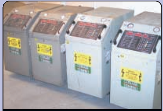
CONAIR TEMPO TC1-DI WATER TEMPERATURE CONTROLS