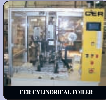
CER CYLINDRICAL FOILER