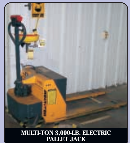
MULTI-TON 3,000-LB. ELECTRIC PALLET JACK

Can't Attend? Online Bidding Available. Go to www.crgauction.com