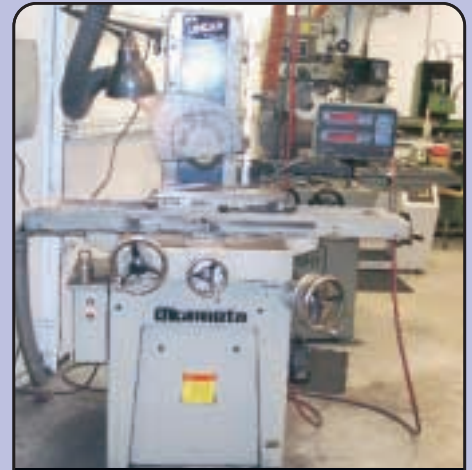
OKAMOTO 618 LINEAR SURFACE GRINDER WITH DRO