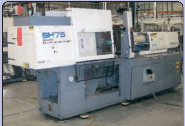
SUMITOMO SH-75, 75-TON INJECTION MOLDING MACHINE