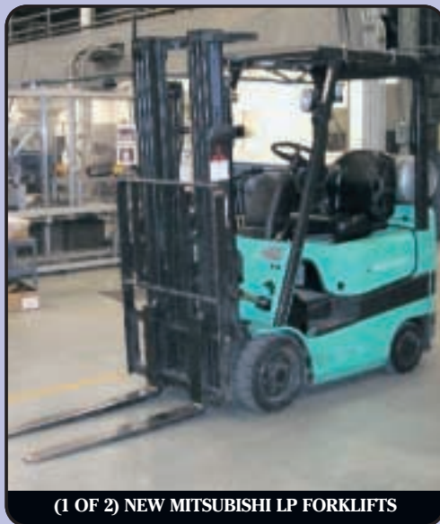
(1 OF 2) NEW MITSUBISHI LP FORKLIFTS