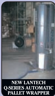
NEW LANTECH Q-SERIES AUTOMATIC PALLET WRAPPER