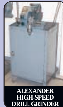
ALEXANDER HIGH-SPEED DRILL GRINDER