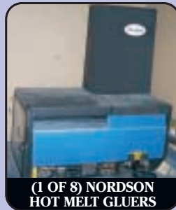
(1 OF 8) NORDSON HOT MELT GLUERS