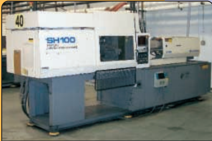
(1 OF 3) SUMITOMO SH-100 INJECTION MOLDING MACHINES