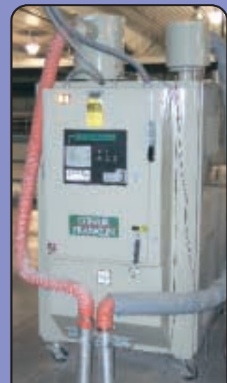
(1 OF 2) CONAIR FRANKLIN CD600 DRYERS FOR CENTRAL LOADING SYSTEMS