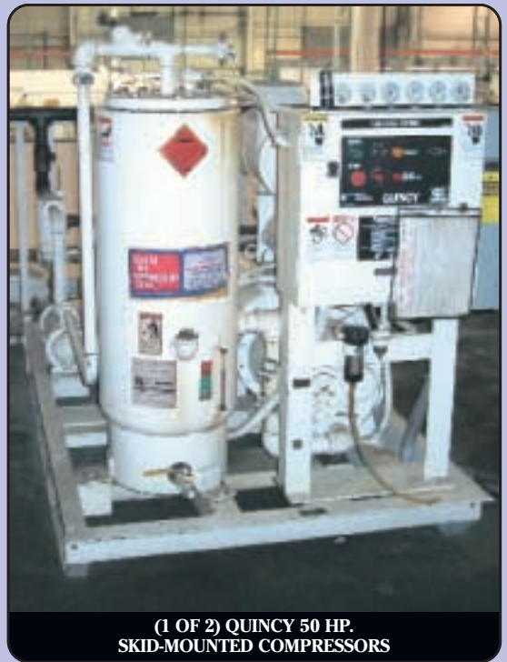
(1 OF 2) QUINCY 50 HP. SKID-MOUNTED COMPRESSORS