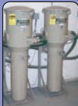
(2 OF 4) BLOWERS FOR CENTRAL LOADING SYSTEM

(2) Like New CONAIR FRANKLIN Systems, each consisting of Compu-Dry CD-600 desiccant dryers, (6–10) 400-lb. hopper loaders, w/electronic load cells, (2) vacuum filters, surge hopper, steel rack mounts, digital PLC controls, w/related pumps and blowers.