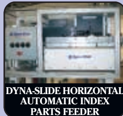
DYNA-SLIDE HORIZONTAL AUTOMATIC INDEX PARTS FEEDER