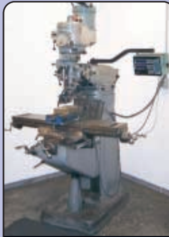
(1 OF 4) BRIDGEPORT 2 HP. VERTICAL MILLS WITH DRO

BRANSON Stainless Steel Parts Degreasers .