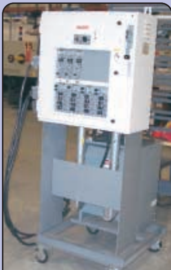
(1 OF 6) HUSKY-MAGNAFLUX HOT RUNNER CONTROLS