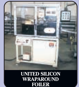
UNITED SILICON WRAPAROUND FOILER