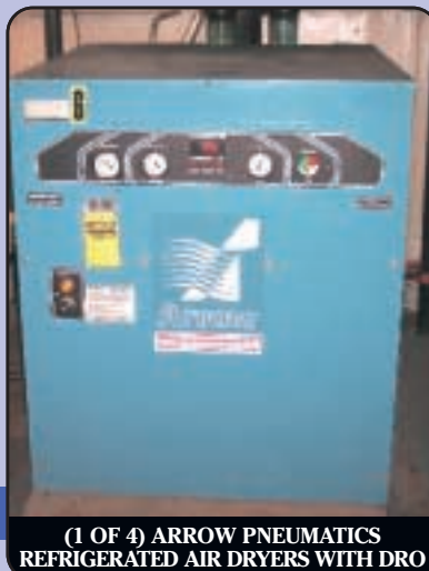
(1 OF 4) ARROW PNEUMATICS REFRIGERATED AIR DRYERS WITH DRO