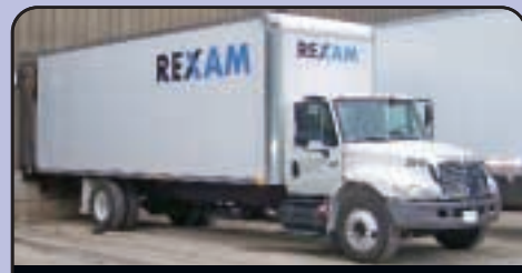
NEW 2004 INTERNATIONAL 4300 DIESEL BOX TRUCK