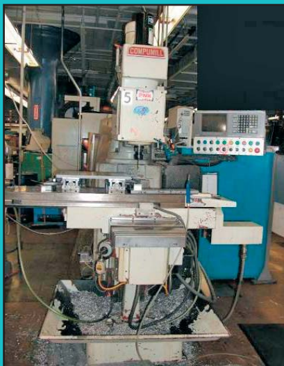
COMPUMILL CNC VERTICAL MILLING MACHINE

Monday, August 15th, 9:00 A.M. to 4:00 P.M.