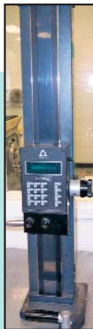
DIGITAL HEIGHT GAGE