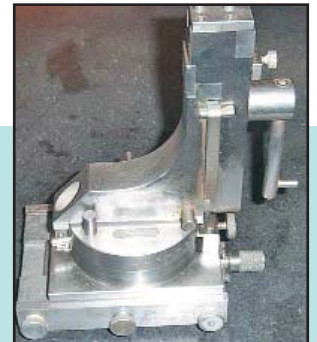
RADI ANGLE DRESSER