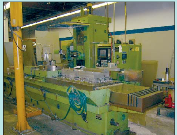
HITACHI SEIKI HC800 HORIZONTAL MACHINING CENTER