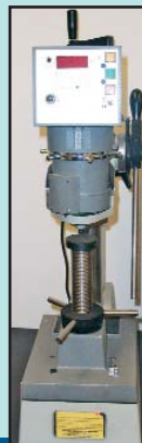
ROCKWELL DIGITAL HARDNESS TESTER