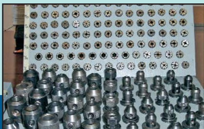
COLLETS & TOOLHOLDERS

1962 MONARCH Mdl. 610TX30 Engine Lathe , 15 hp., 12-1,500 RPM, 2-axis DRO.