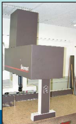
STARRETT RAPID CHECK CMM