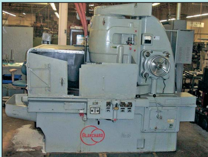
BLANCHARD ROTARY SURFACE GRINDER