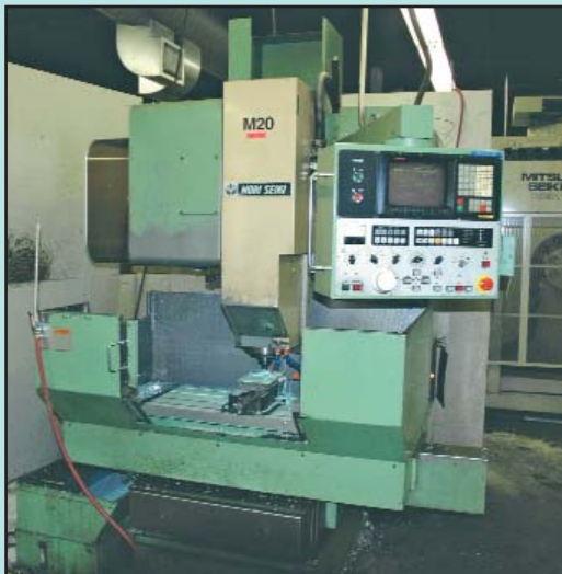
MORI SEIKI CNC VERTICAL MACHINING CENTER

SHARP Mdl. 1760K Gap Bed Lathe , 17" x 60", 7-1/2 hp.