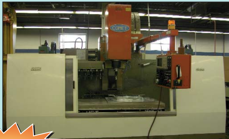
MIGHTY COMET VERTICAL CNC