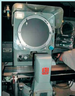
JONES & LAMSON OPTICAL COMPARATOR, w/DRO