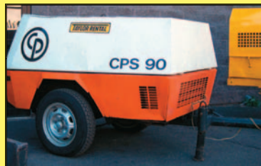
CHICAGO PNEUMATICS 90 CFM PORTABLE COMPRESSOR