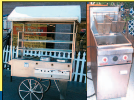
PROPANE STAINLESS STEEL HOT DOG WAGON