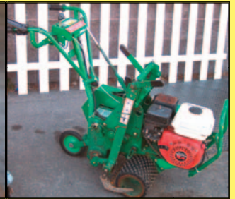
RYAN 18" GAS SOD CUTTER