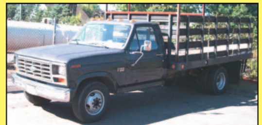
(1 OF 2) FORD F350 12' STAKE BODY TRUCKS