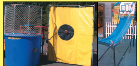
CARNIVAL DUNK TANK