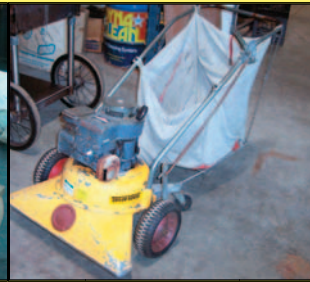
(1 OF 4) BILLY GOAT YARD VACS