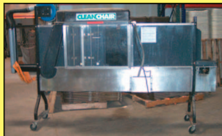
PORTABLE STAINLESS STEEL PASS-THROUGH CHAIR WASHING MACHINE

Extensive Inventory of New Safety Equipment & Supplies Including Respirators, Boots, Hard Hats, Filters, Harnesses, & More!