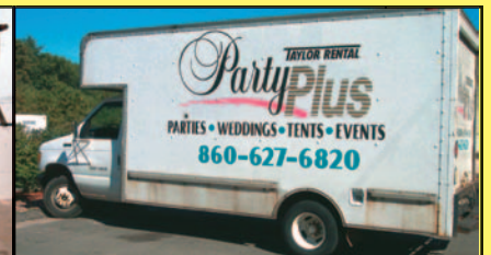
18' VAN TRUCK