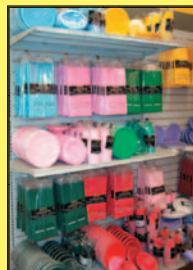
NEW PARTY SUPPLIES