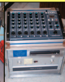
300-WATT x 6-CHANNEL PORTABLE SOUND SYSTEM