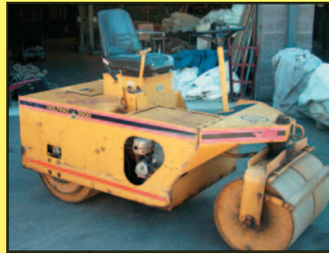
STONE WOLFPACK 2500 STATIC ROLLER