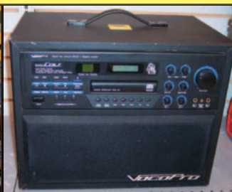
VOCOPRO COLT DJ AUDIO-VIDEO SYSTEM