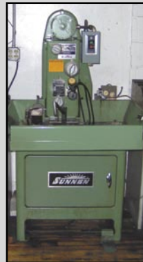
SUNNEN MBB-1660 PRECISION HONE