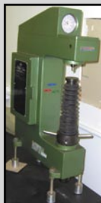
< FIE ROCKWELL SCALE HARDNESS TESTER