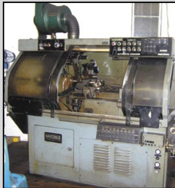
(1 OF 2) HARDINGE AHC AUTOMATIC CHUCKING LATHES