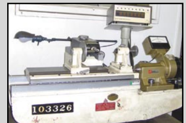
PRATT & WHITNEY PRECISION LEAD THREAD CHECKER