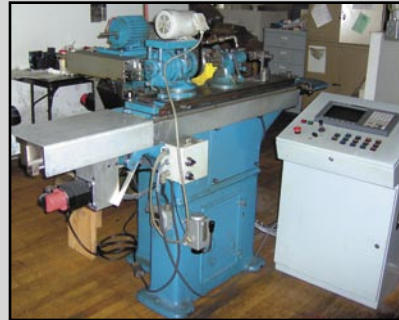
BROWN & SHARPE OD GRINDER, w/FANUC CNC RETRO-FIT