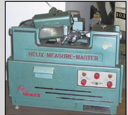
GREENFIELD MEASURE MASTER HELICAL THREAD GAUGE