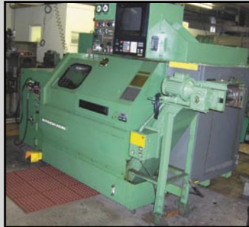
HITACHI SEIKI HT-20 CNC TURNING CENTER