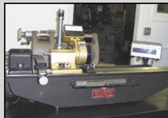
PRATT & WHITNEY SUPER MICROMETER, w/DRO