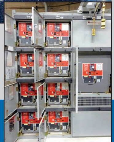
SAMPLE SWITCH GEAR