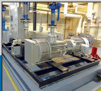
BUSCH VACUUM PUMP SKID

For complete catalog crgllc.com 1.800.300.6852