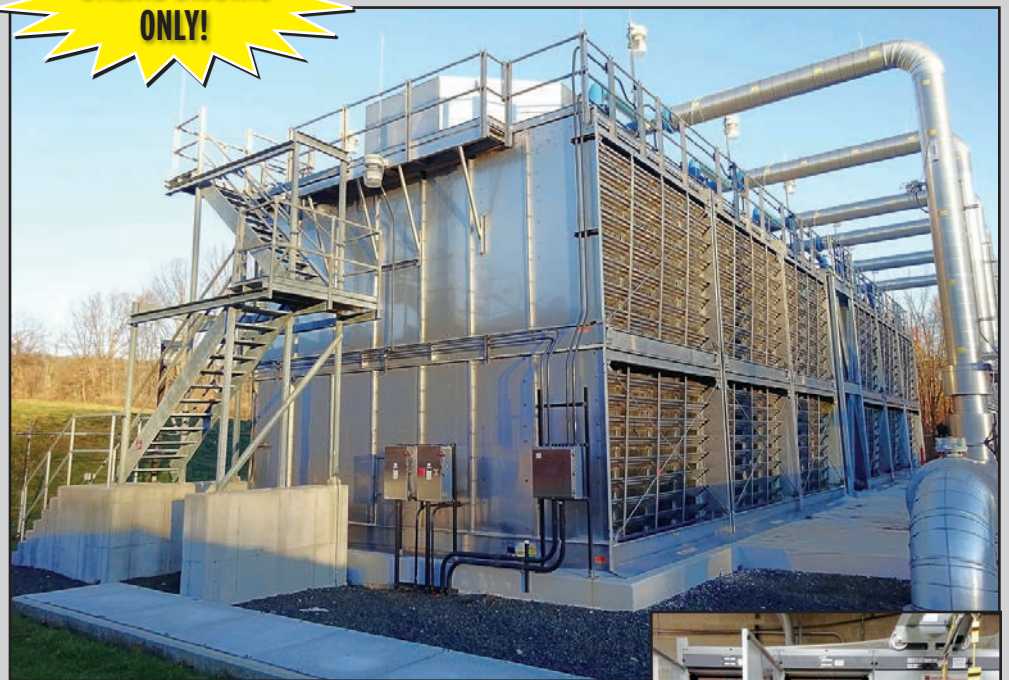
(6) NEW BAC COOLING TOWERS

For complete catalog crgllc.com 1.800.300.6852