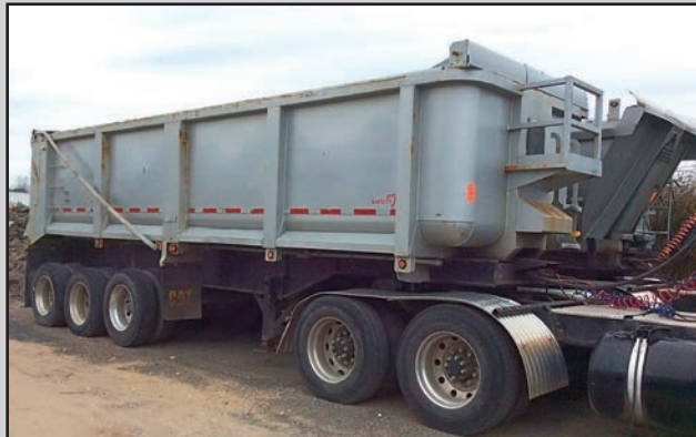
CLEMENT DUMP TRAILER