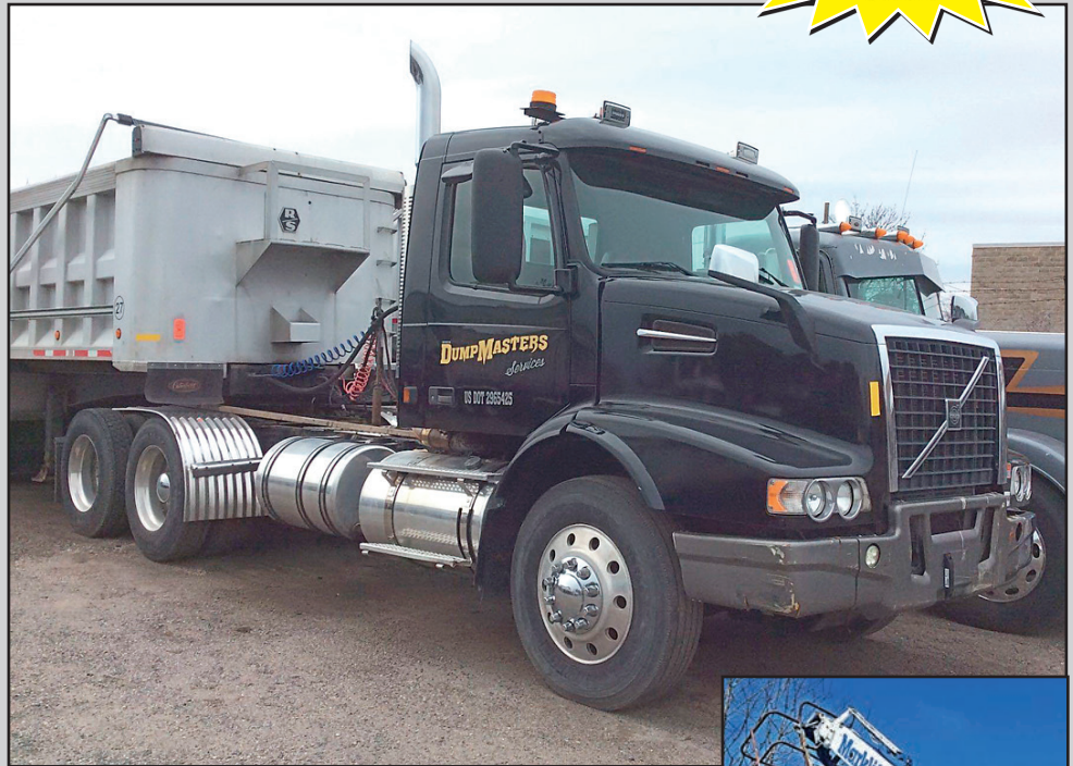
VOLVO VHD TRACTOR