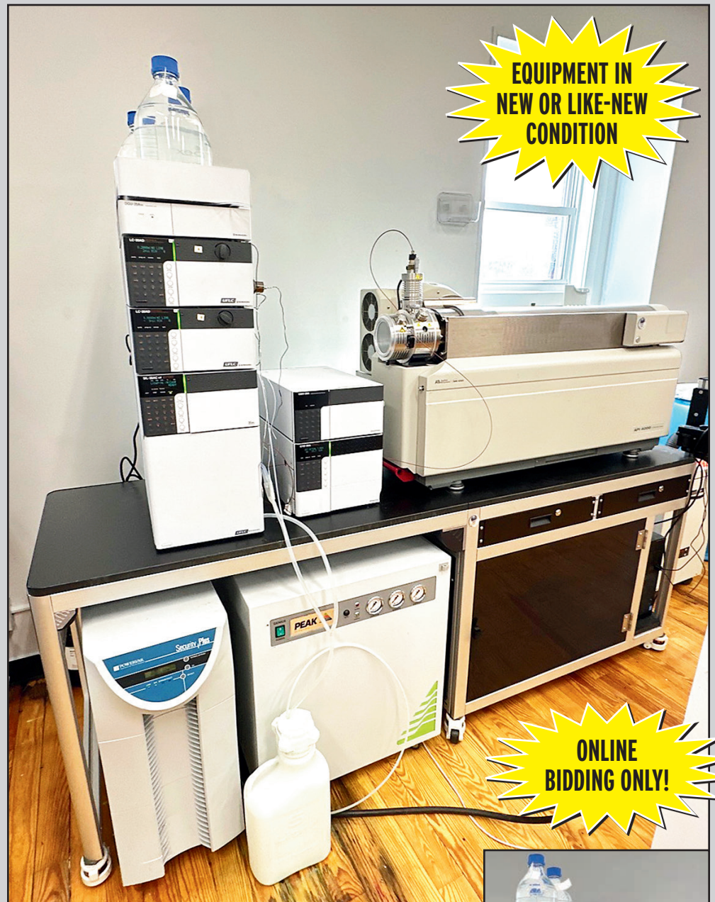
(1 OF 3) LIQUID CHROMATOGRAPHY TANDEM MASS SPECTROMETRY SYSTEMS