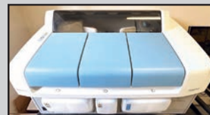
(1 OF 2) THERMO SCIENTIFIC THERMO SCIENTIFIC INDIKO™ PLUS CHEMICAL ANALYZERS