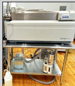
APPLIED BIOSYSTEMS MDS SCIEX-4000 Q-TRAP MASS SPECTROMETER WITH VARIAN VACUUM PUMP