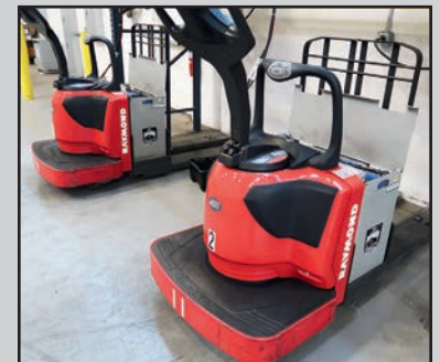
RAYMOND ELECTRIC PALLET JACKS