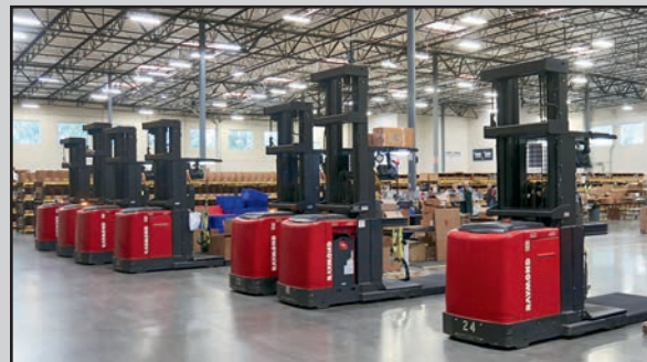
RAYMOND ORDER PICKERS